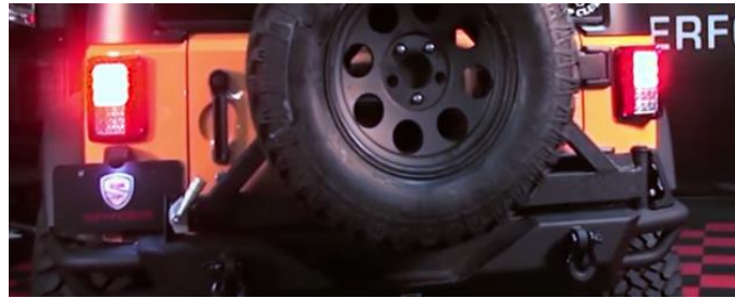
7. Turn on lights and confirm all functions are working properly. You have successfully completed the install of your new Spyder LED tail lights.