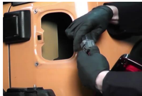
4. Connect Spyder wire harness.