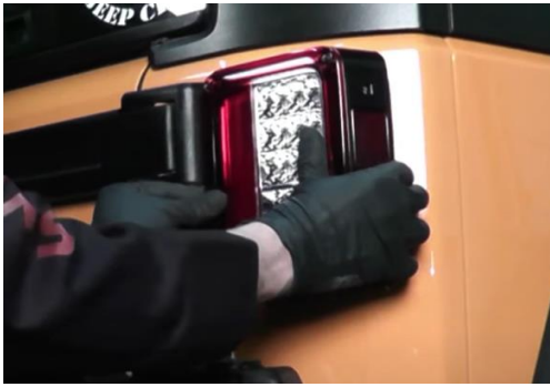
5. Seat Spyder tail light.