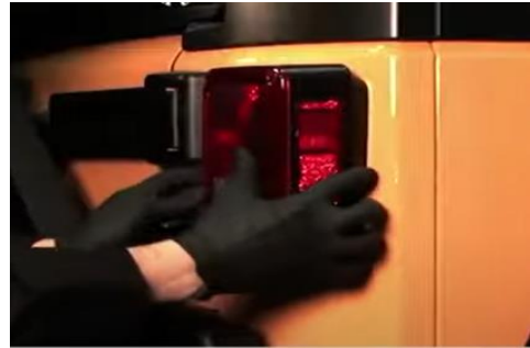
2. Unseat tail light.