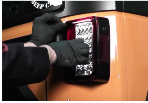
6. Reinstall (2x) phillips screws.