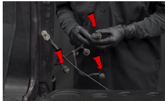
4. Remove bulbs from top and bottom brake/signal and also side marker bulb.