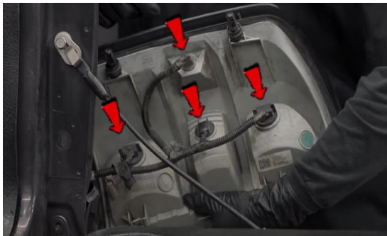
3. Remove (4x) bulb sockets from tail light.