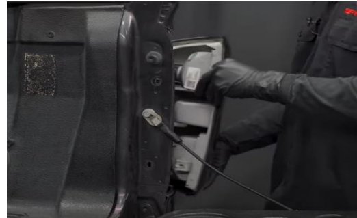
2. Unseat tail light using panel popper.