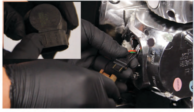
7) Line up the black wire side of the Spyder socket insert with the ground wire side of the brake/park/turn signal socket to ensure correct polarity, then install the socket.