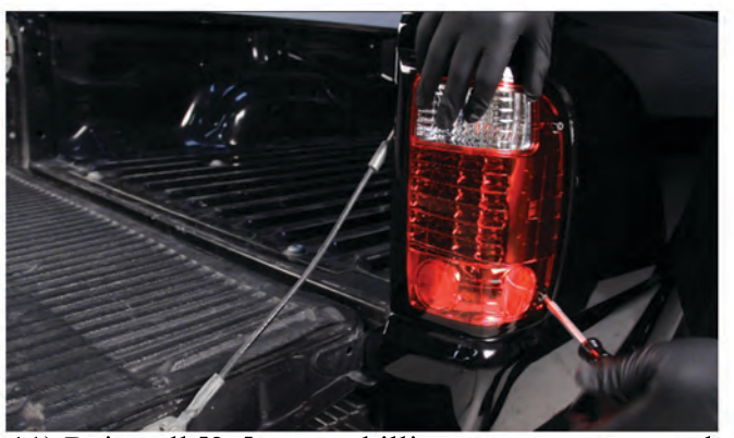
11) Reinstall [2x] outer phillips screws to secure the tail light.