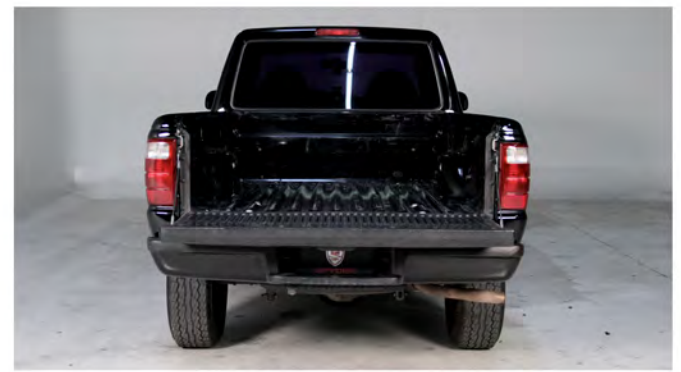
1) Open the tailgate.