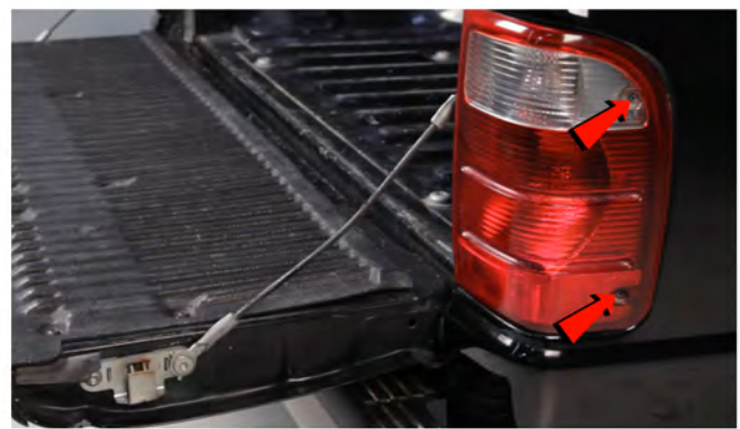
3) Remove the [2x] outer phillips screws securing the tail light.