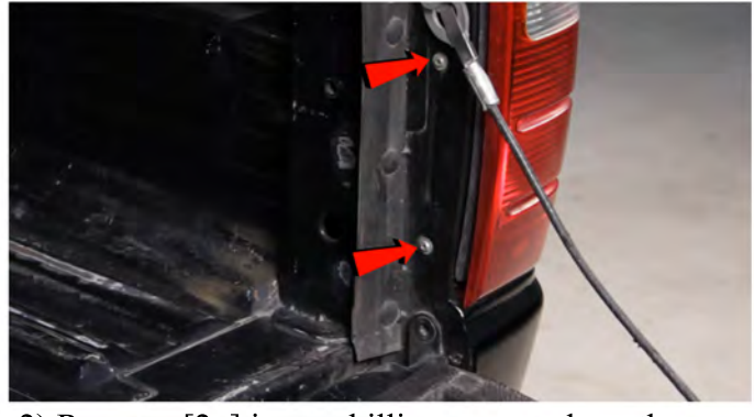
2) Remove [2x] inner phillips screws along the tailgate sill securing the tail light.