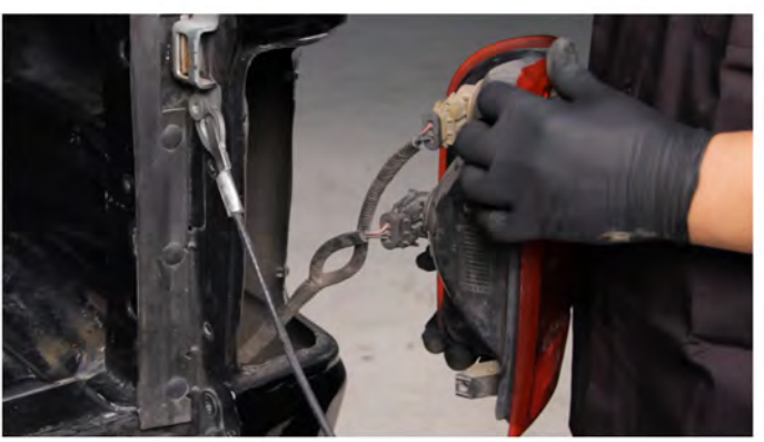
4) Unseat the tail light, then disconnect the reverse harness and the park/brake/turn harness.