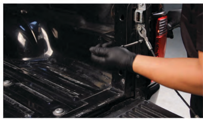
12) Reinstall [2x] phillips screws securing the tail light along the tailgate sill.