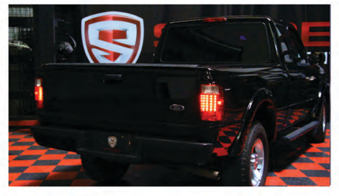
13) Close the tailgate and enjoy your new Spyder LED Tail lights.