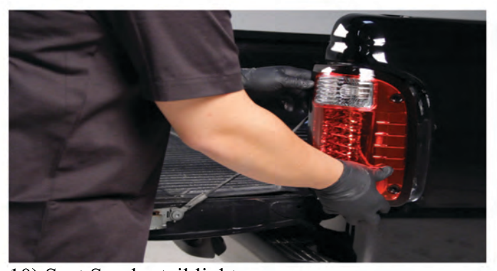
10) Seat Spyder tail light.