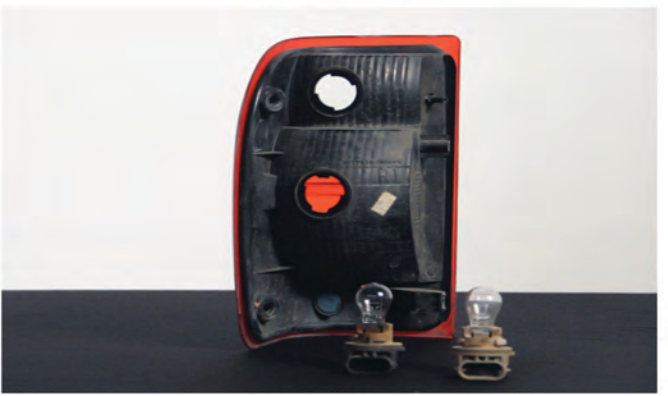
5) Remove the brake/park/turn signal and reverse lamp sockets from the OEM tail light. Never touch exposed bulbs with bare hands.