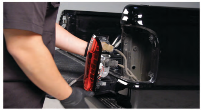
9) Reconnect the reverse lamp and brake/park/turn signal harnesses.