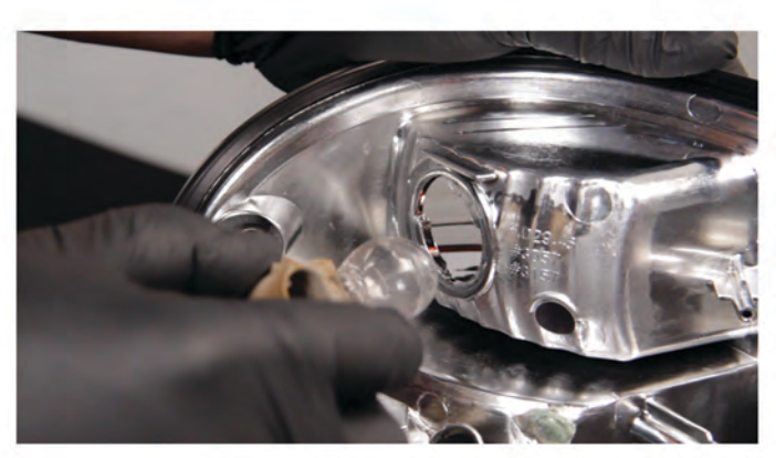
8) Install the reverse socket into the Spyder tail light.