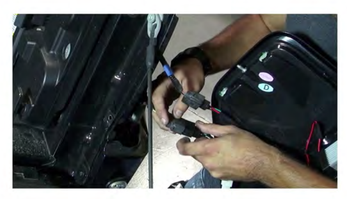
4) Locate your SPYDER tail light. Connect the OEM wiring harness to your SPYDER tail light. Be sure to install the reverse lamp bulb socket.