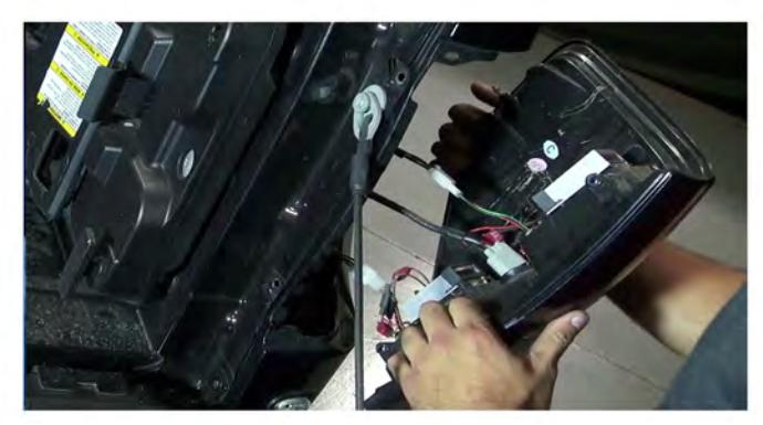
3) Disconnect the brake light and turn signal wiring harnesses, then remove the reverse lamp bulb socket.