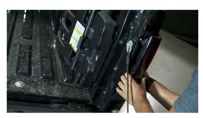
2) Unseat the tail light.