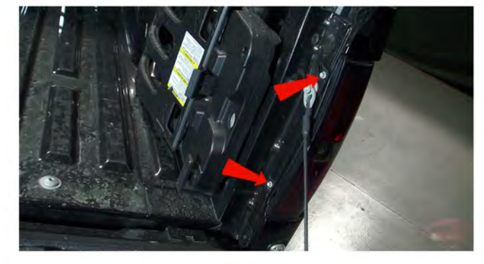
1) Open the tailgate. Remove the two 8mm bolts securing the tail light.