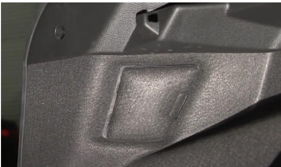
1. Remove tail light access panel.