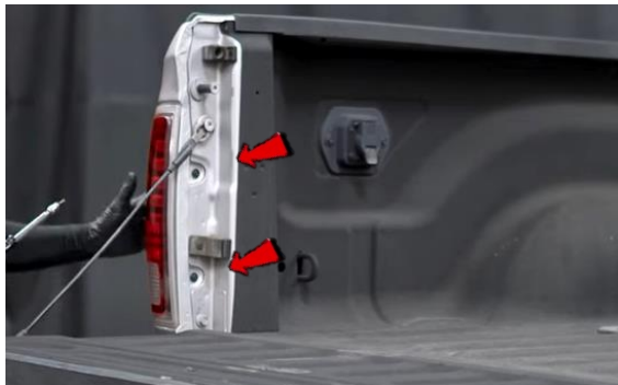
1. Remove (2x) T20 torx screws.