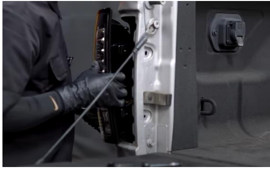
5. Seat Spyder tail light.