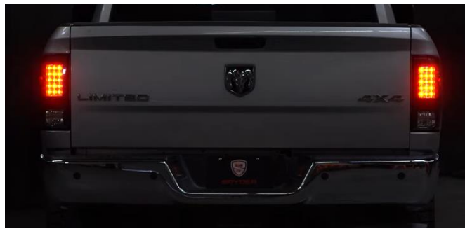
9. Turn on lights and confirm all functions are working properly. You have successfully completed the install of your new Spyder LED tail lights.