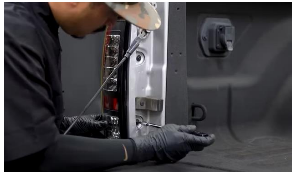
6. Reinstall (2x) T20 torx screws.