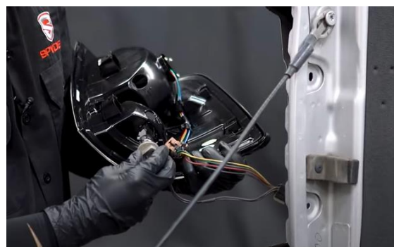
4. Install reverse socket and brake light harness onto Spyder tail light.