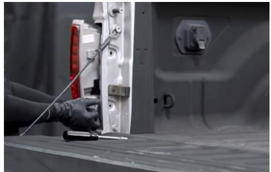
2. Unseat tail light.