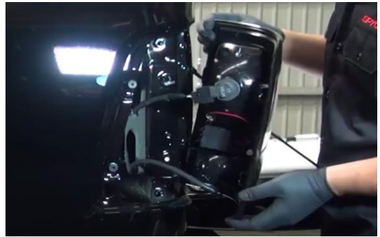
6. Install sockets into Spyder tail light.