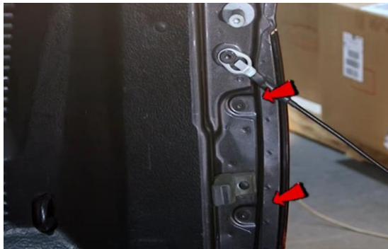
1. Remove (2x) T25 torx screws.