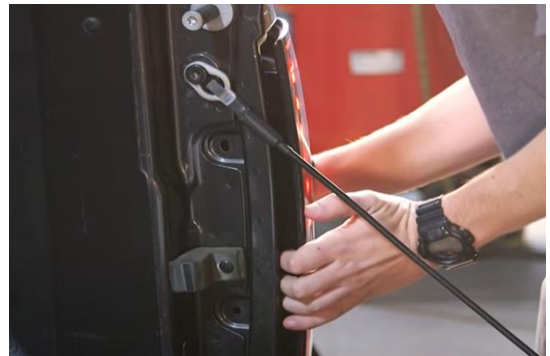
2. Unseat tail light.