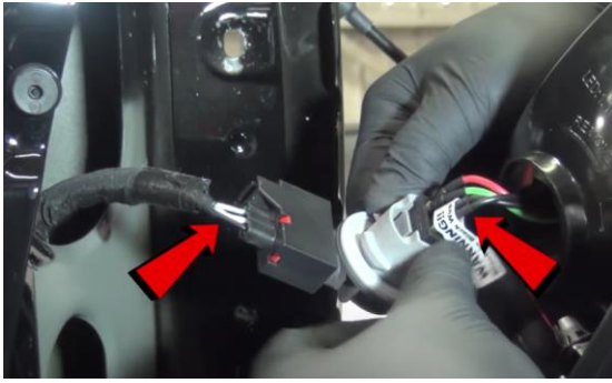
5. Install socket insert with black wire on the black wire side of socket.