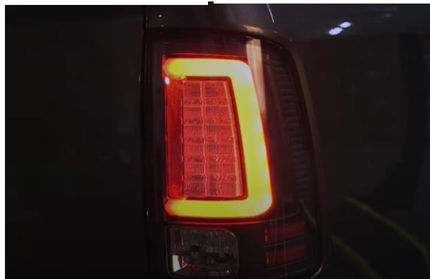
9. Turn on lights and confirm all functions are working properly. You have successfully completed the install of your new Spyder LED tail lights.