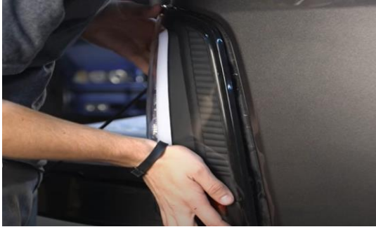
7. Seat Spyder tail light.