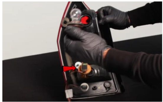
6. Remove bulb sockets from tail light, next remove harness from tail light. (Make sure never to touch bulbs with bare hands)