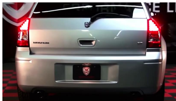
15. Turn on lights and confirm all functions are working properly. You have successfully completed the install of your new Spyder tail lights.