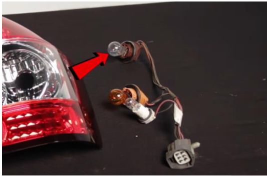
7. Remove brake lamp bulb from socket.