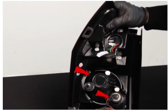
8. Install reverse socket and turn signal socket into Spyder tail light.