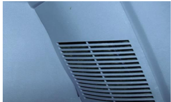
14. Reinstall access cover.