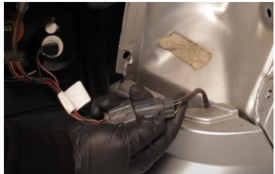
10. Connect wiring harness to Spyder tail light.