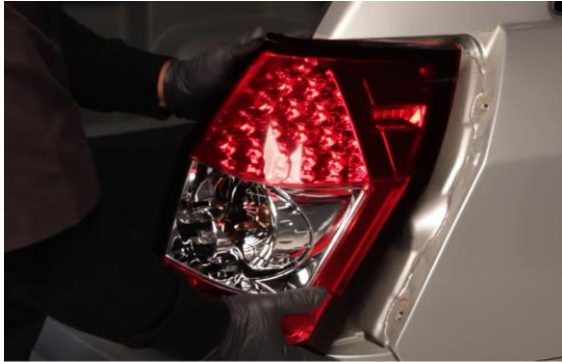
11. Seat Spyder tail light.