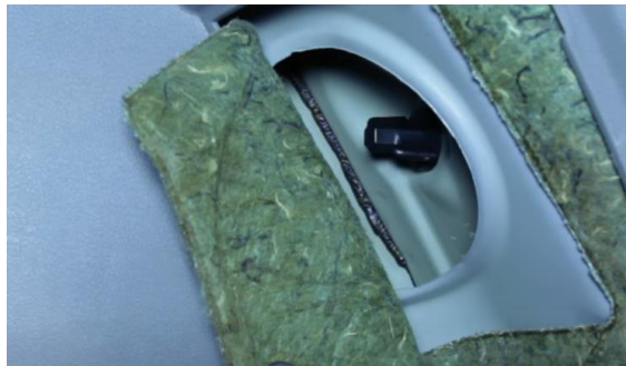
13. Reinstall thumbscrew securing tail light.