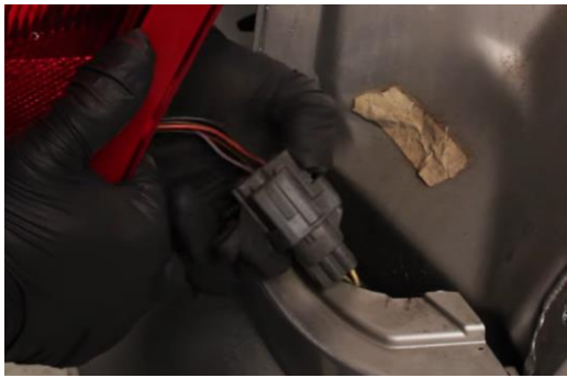
5. Disconnect tail light harness.