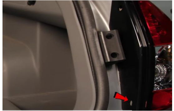
12. Reinstall (2x) plastic retainers.