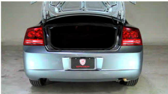
1) Open the trunk.

If you are unfamiliar with the installation processes, professional installation is highly recommended.