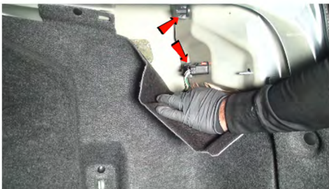
3) Remove the [2x] thumbscrews securing the tail light hidden under the trunk liner.