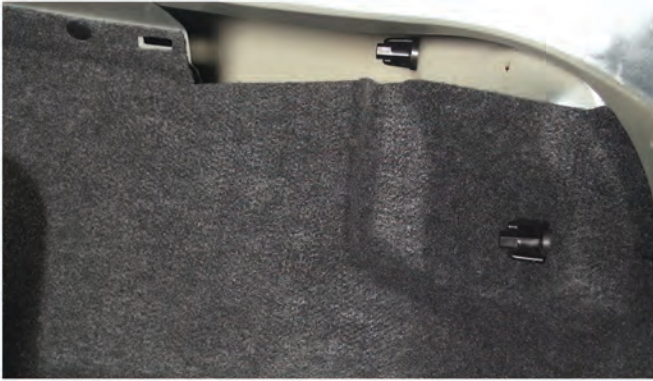
11) Replace the trunk liner and reinstall the outer thumbscrew.