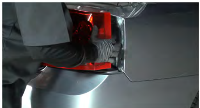
4) Unseat the tail light.