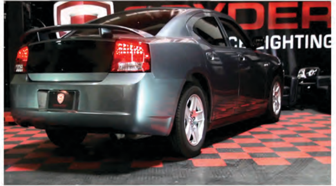
12) Close the trunk and enjoy your new Spyder LED tail lights.