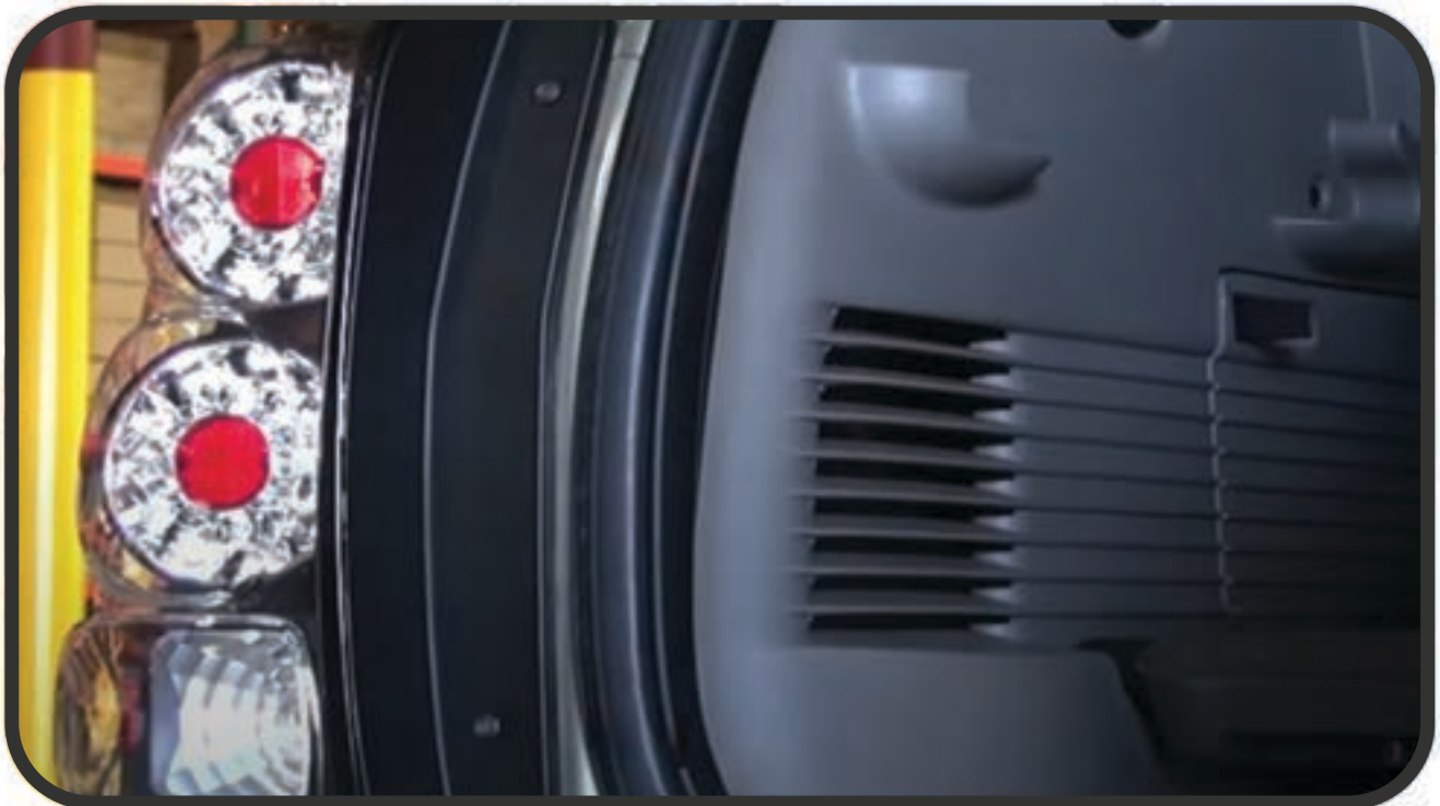
STEP 9: SEAT THE SPYDER TAIL LIGHT AND REINSTALL THE (2) PHILLIPS SCREWS SECURING THE TAIL LIGHT