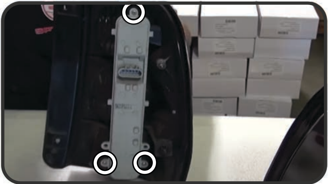
STEP 4: REMOVE (3) PHILLIPS SCREWS SECURING THE BULB BAR