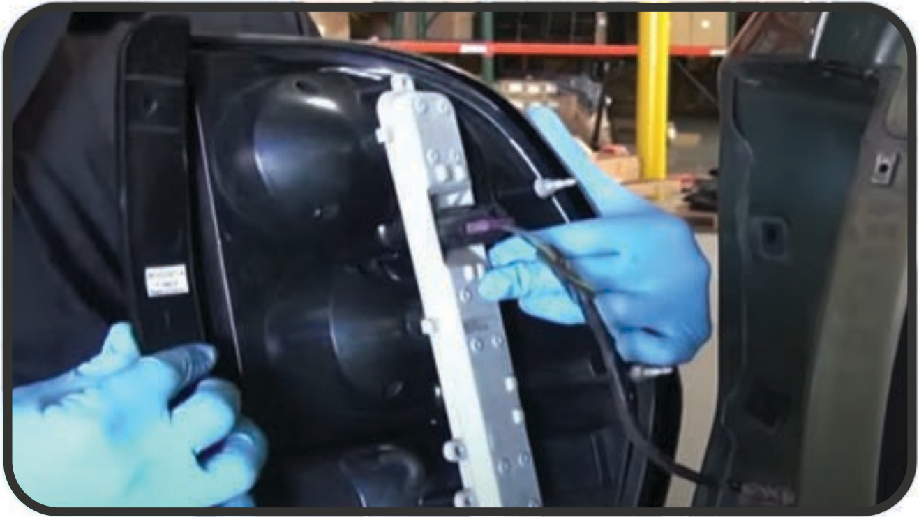
STEP 8: RECONNECT THE WIRE HARNESS