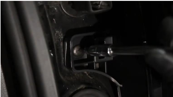
7. Reinstall (2x) T15 torx screws.