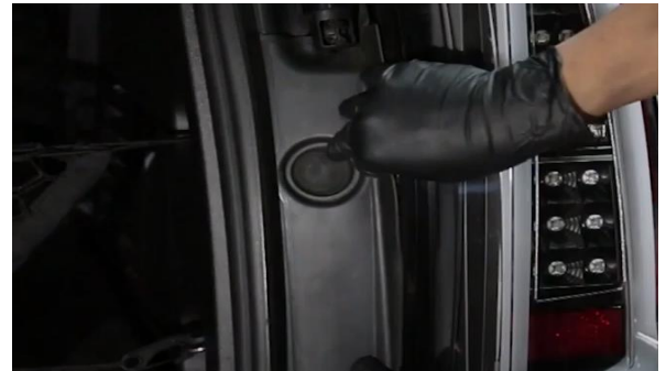
8. Reinstall tail light cover panel.