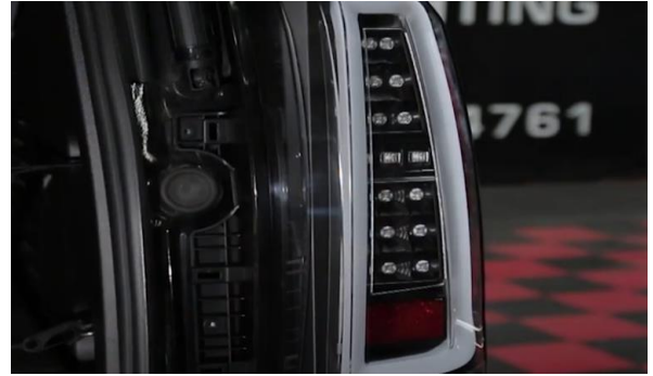
6. Seat Spyder tail light.