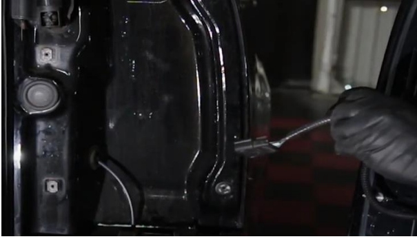
5. Guide threwh Spyder tail light harness.