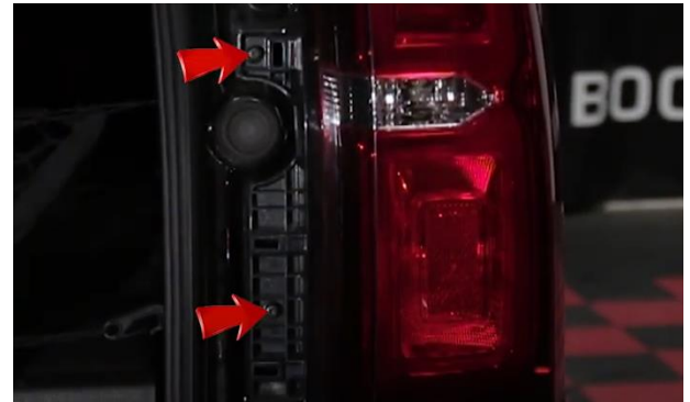
2. Remove (2x) T15 torx screws.