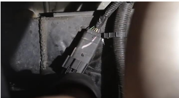
9. Connect Spyder tail light harness.