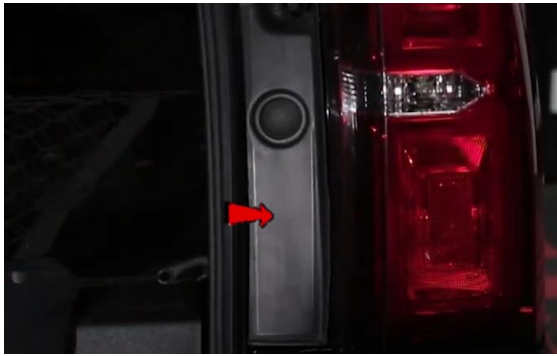
1. Remove tail light panel cover.