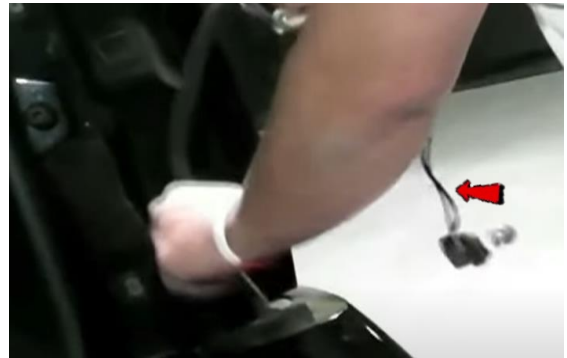
4. Remove factory harness.