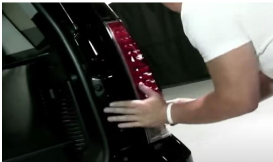
7. Seat Spyder tail light.