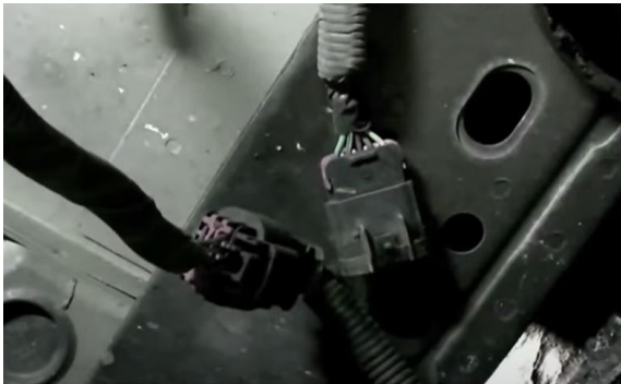
3. Disconnect main tail light harness hidden in the bumper under the car.