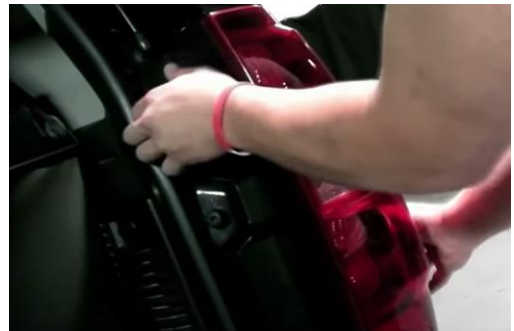
2. Unseat tail light.