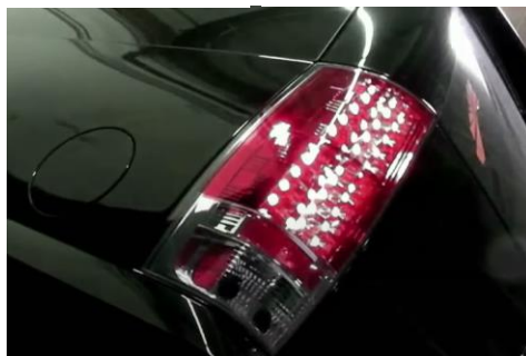
9. Turn on lights and confirm all functions are working properly. You have successfully completed the install of your new Spyder tail lights.