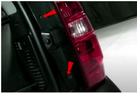
1. Remove (2x) phillips screws.