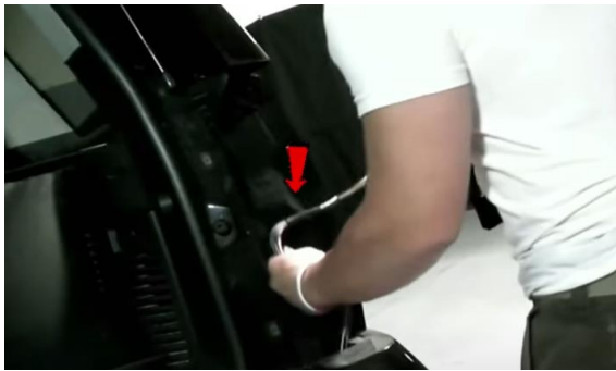
5. Feed in Spyder tail light harness.