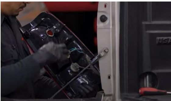
3. Remove (3x) bulb sockets from tail light. (Never touch bulbs with bare hands)