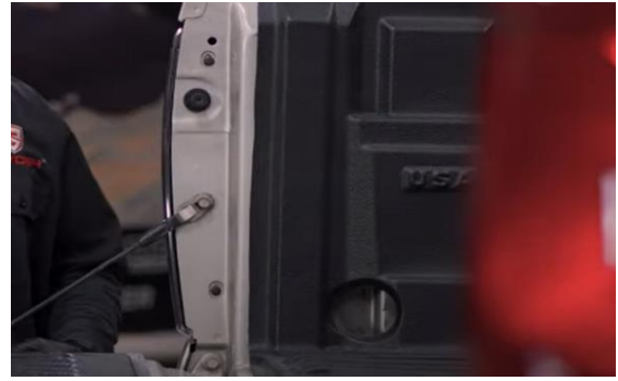
6. Reinstall (2x) phillips screws securing tail light.