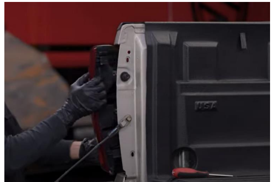
2. Unseat tail light.