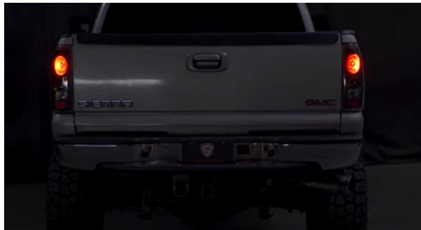
7. Turn on lights and confirm all functions are working properly. You have successfully completed the install of your new Spyder tail lights.