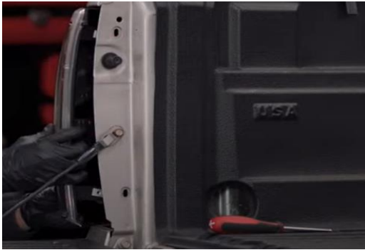
5. Seat Spyder tail light.