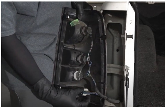
3. Remove (3x) bulb sockets from tail light. (Never touch bulbs with bare hands)