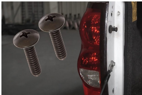
1. Remove (2x) phillips screws.