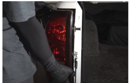
2. Unseat tail light.