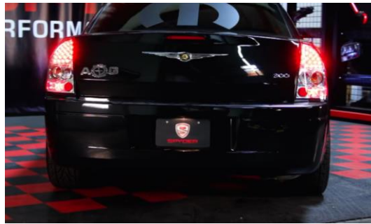
13. Turn on lights and confirm all functions are working properly. You have successfully completed the install of your new Spyder LED tail lights.