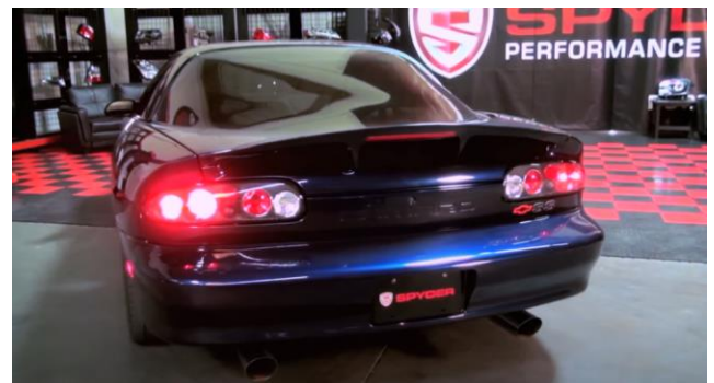
16. Turn on lights and confirm all functions are working properly. You have successfully completed the install of your new Spyder LED tail lights.