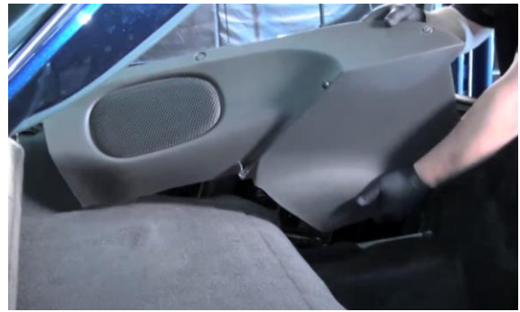
4. Remove the cover panel and set it aside.