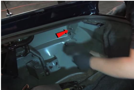
7. Remove thumb screw located behind spare tire.