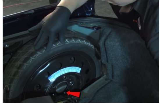
6. Remove spare tire retainer and spare tire.