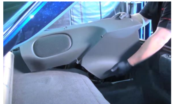
14. Reinstall speaker harness and cover panel.