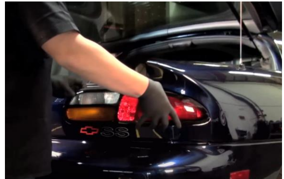
8. Unseat the tail light.