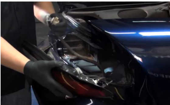
9. Remove all bulb sockets from tail light.