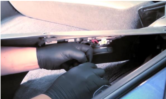
3. Unseat the cover panel and disconnect speaker harness.