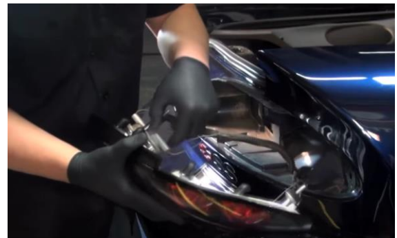
10. Install bulbs into the corresponding sockets on Spyder tail light.