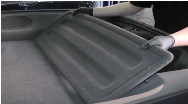
1. Remove trunk filler panel.