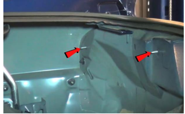
12. Reinstall (2x) thumbscrews to secure tail light.