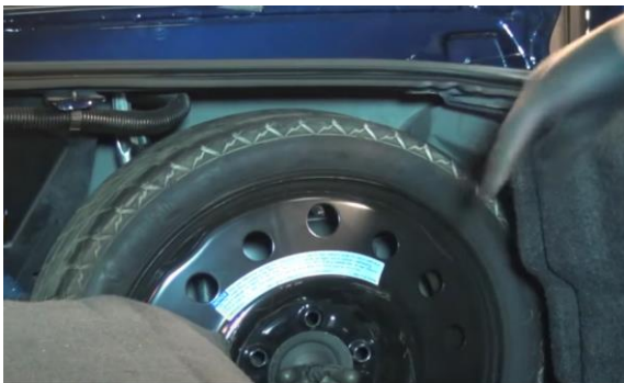
13. Reinstall spare and spare tire retainer hook.