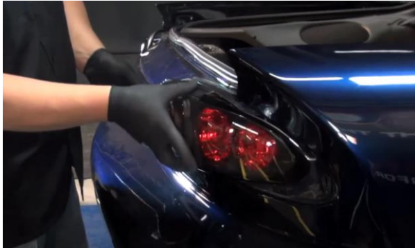
11. Seat Spyder tail light.