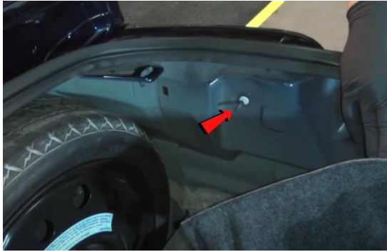
5. Remove (1x) inner thumbscrew securing tail light.