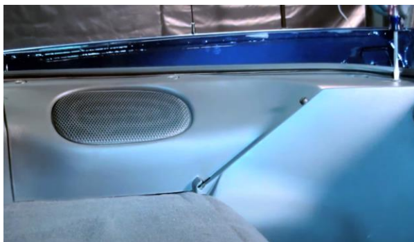
15. Lock (3x) retainers with flathead screwdriver and reinstall trunk filler panel.