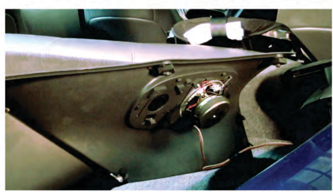
14) Reconnect the speaker harness for the spare tire cover panel.