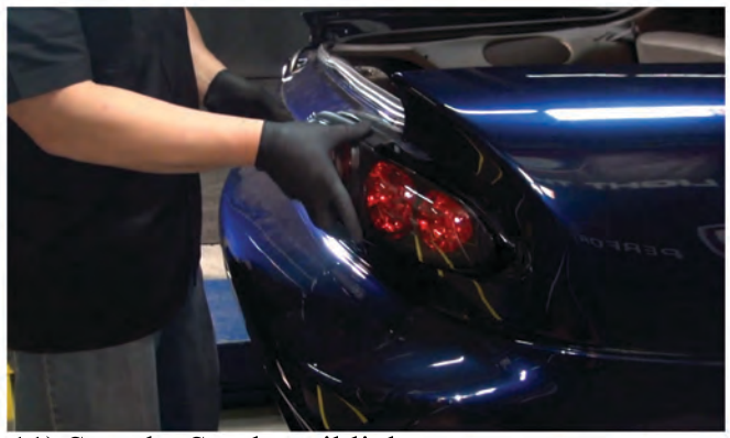
11) Seat the Spyder tail light.