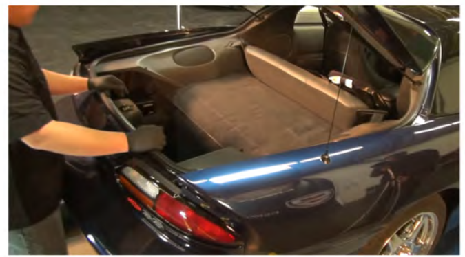
1) Open the hatch.