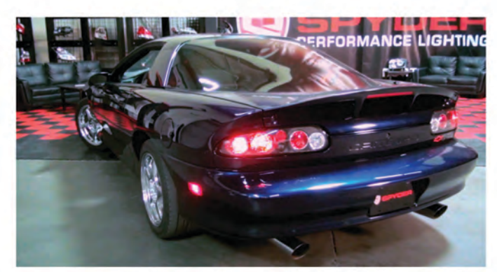
16) Close the hatch and enjoy your new Spyder Euro-style tail lights.