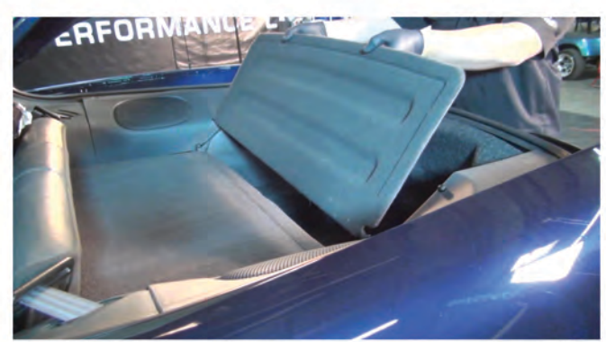
15) Seat the spare tire cover panel, then lock the three flathead retainers to secure the panel. Then reinstall the trunk separator panel.