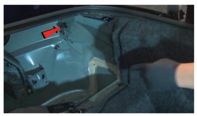
7) Remove the outer thumbscrew securing the tail light which was hidden by the spare tire.