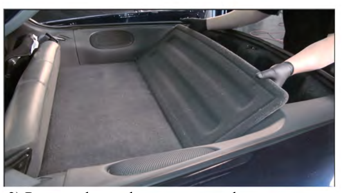
2) Remove the trunk separator panel.