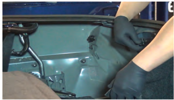
12) Reinstall [2x] thumbscrews to secure the tail light.