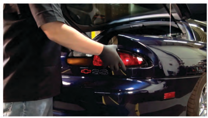
8) Unseat the tail light.