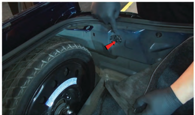
5) Peel back the trunk liner, then remove the inner thumbscrew securing the tail light.