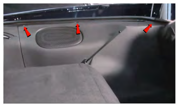
3) Unlock [3x] Flathead retainers securing the spare tire cover panel.