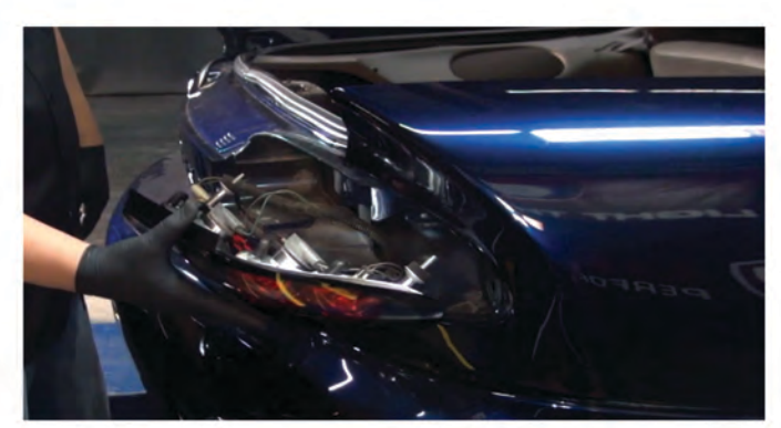
10) Install the brake lamp, reverse lamp and turn signal sockets into the Spyder tail light.