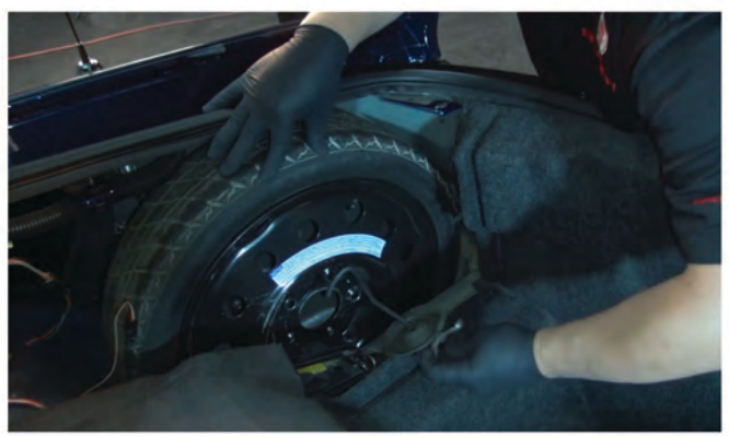
6) Remove the spare tire retainer hook, then remove the spare tire and set it aside.