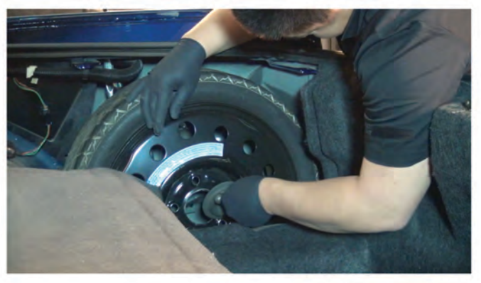
13) Reinstall the spare tire, then reinstall the spare tire retainer hook.