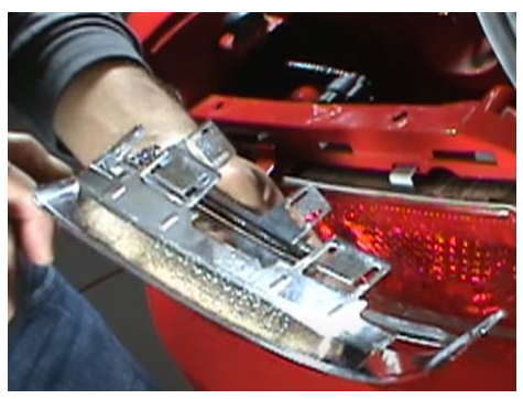
5. Remove (2x) tail light bezels.