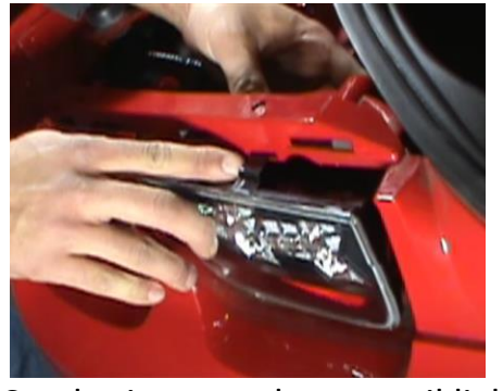
7. Seat Spyder inner and outer tail lights making sure to seat guide tabs.