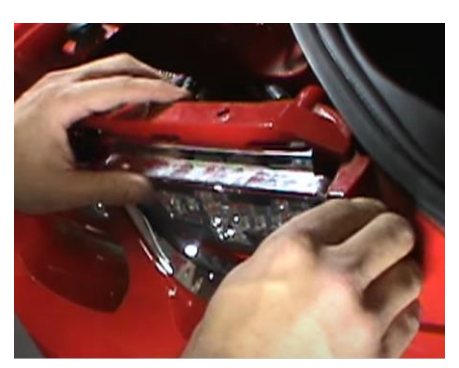
8. Reinstall (2x) tail light bezels.