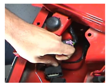
9. Connect inner and outer tail light harness to Spyder tail lights.