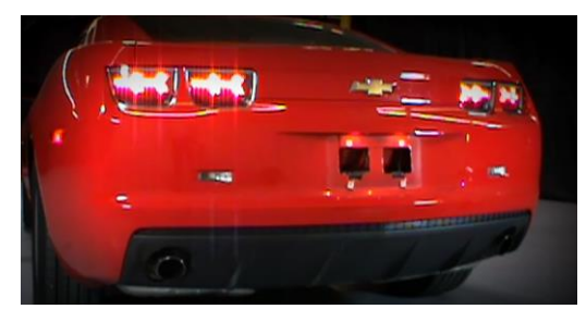
12. Turn on lights and confirm all functions are working properly. You have successfully completed the install of your new Spyder LED tail lights.