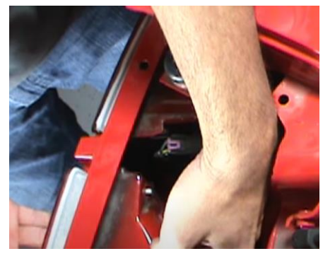
6. Remove inner and outer tail light.