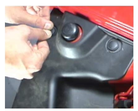
11.Reinstall cover panel and (3x) plastic retainers.