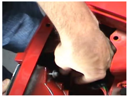
10. Reinstall (4x) 10mm nuts.