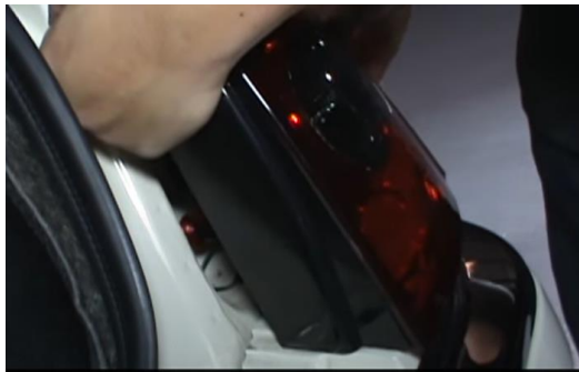
7. Seat Spyder tail light making sure not to pinch harness.