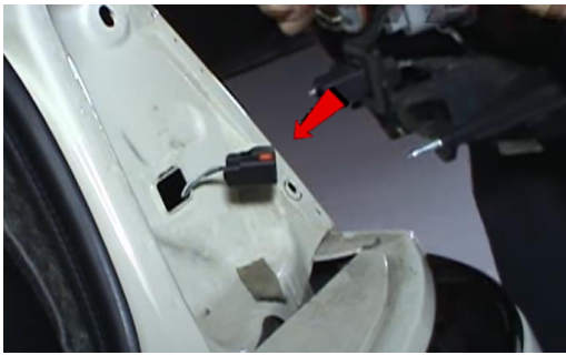
5. Disconnect tail light harness.