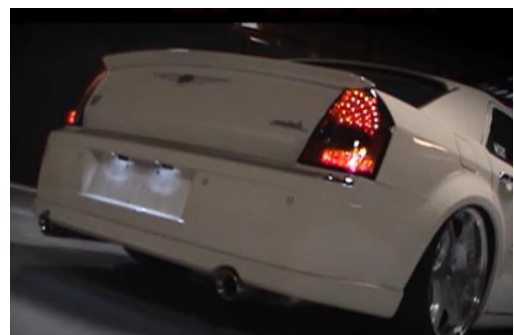
10. Turn on lights and confirm all functions are working properly. You have successfully completed the install of your new Spyder LED tail lights.