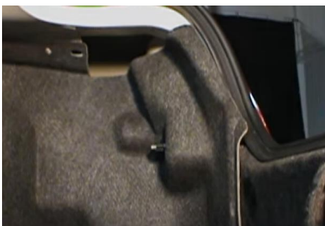
9. Reinstall carpet and (1x) thumb screw to secure carpet.