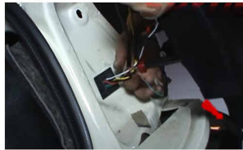
6. Connect Spyder tail light and secure rubber grommet.