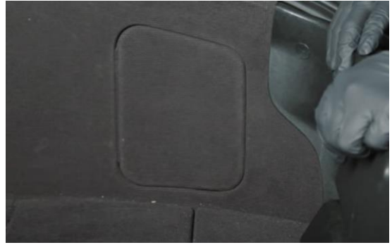
12. Close access panel.