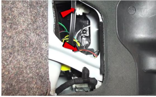
11. Reinstall the (x2) thumbscrews securing the light.