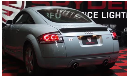
13. Turn on lights and confirm all functions are working properly. You have successfully completed the install of your new Spyder LED tail lights.