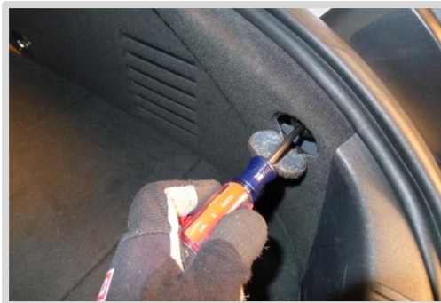
5. Loosen taillight mounting screw