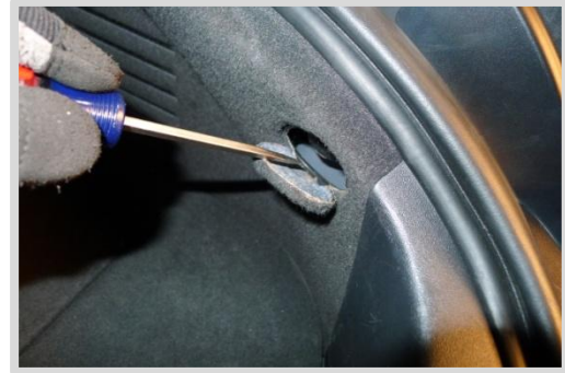
3. Open access hole cover