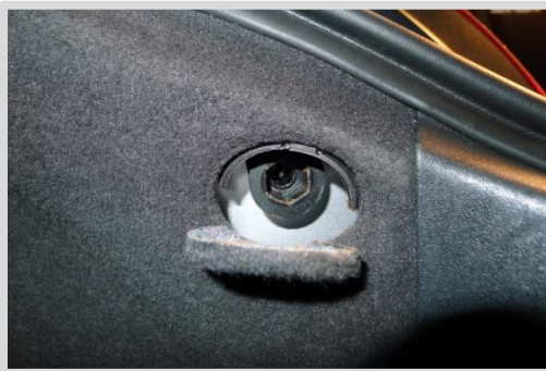
4. Taillight mounting screw