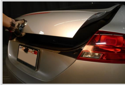
2. Open trunk