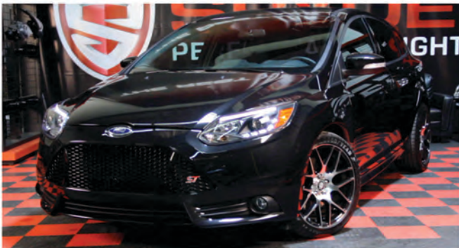
9) Close the hood and enjoy your new Spyder projector headlights.