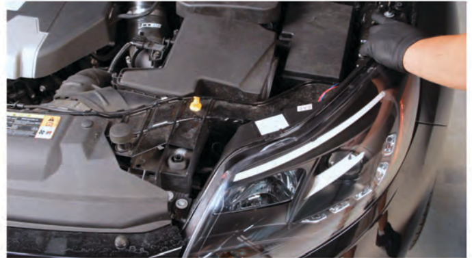
8) Reinstall [2x] T-30 torx screws to secure the headlight.