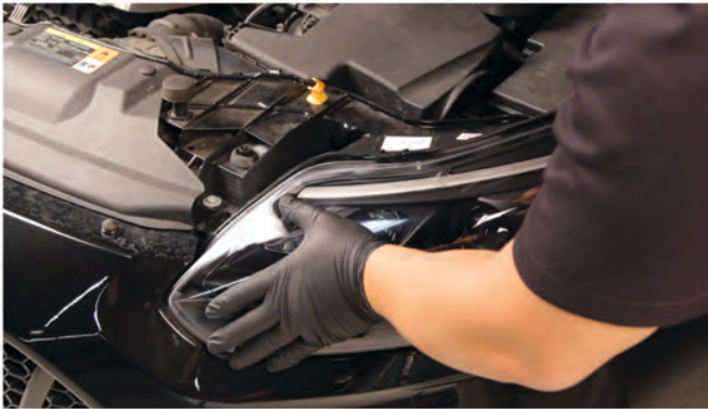
7) Seat the Spyder headlight.