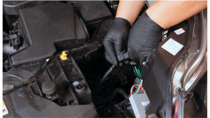
6) Reconnect the wiring harness.