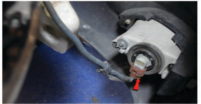
16) Reconnect the foglamp harness.