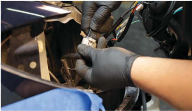
13) Reconnect the turn signal harness.