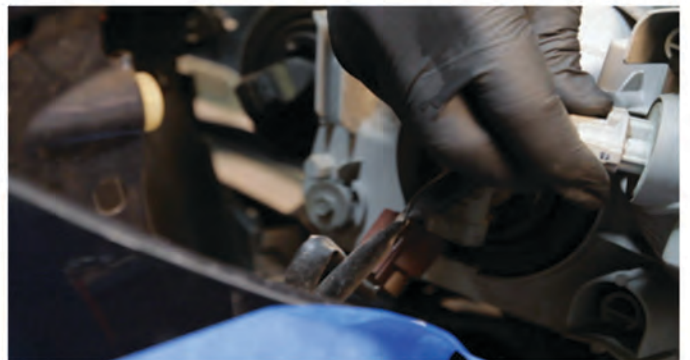
10) Disconnect the turn signal harness.