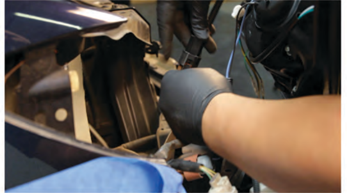
12) Connect the high beam harness to the Spyder headlight.