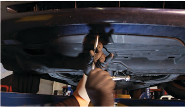
19) Reinstall [7x] 10mm bolts securing the fascia from below.