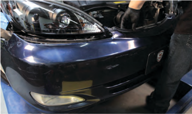
17) Seat the front bumper fascia.