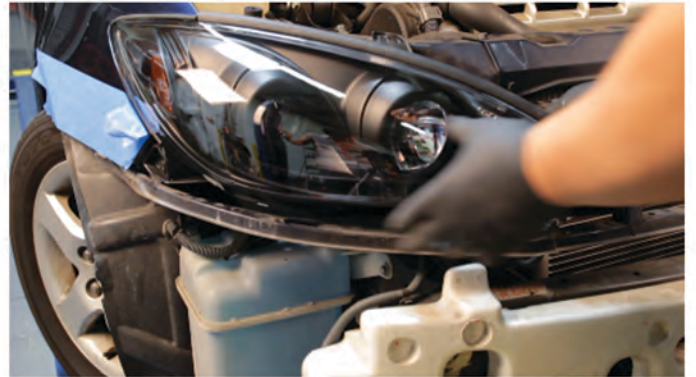
14) Seat the Spyder headlight.