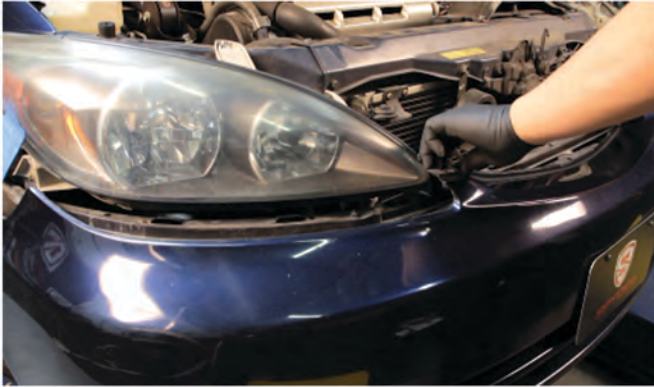
5) Unseat the front bumper fascia.