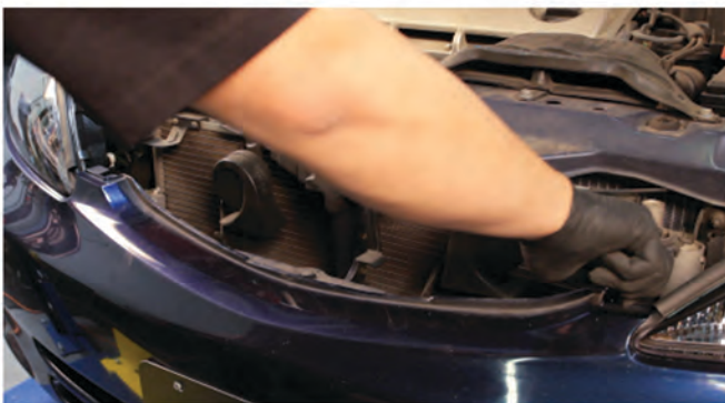
21) Reinstall [2x] 10mm bolts on either side of the grille to secure the fascia.