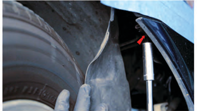
18) Reinstall [1x] 10mm bolt in the fenderwell to secure the front bumper fascia.