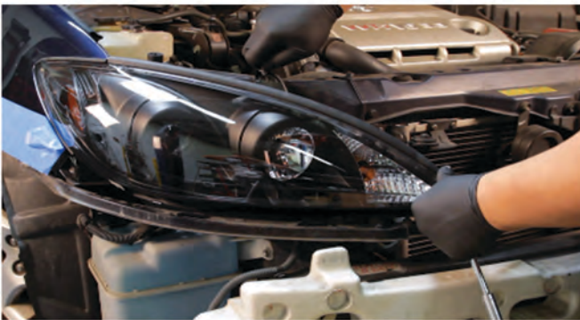
15) Reinstall [2x] 10mm bolts to secure the headlight.