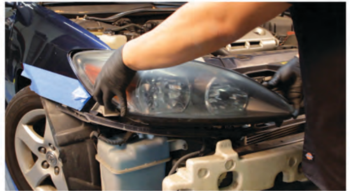
8) Release the headlight retainer tabs, then unseat the headlight.