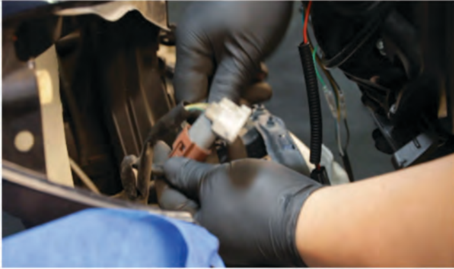
11) Connect the low beam harness to the Spyder headlight.