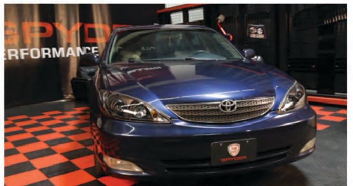
22) Close the hood and enjoy your new Spyder projector headlights.