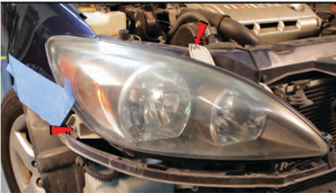
7) Remove [2x] 10mm bolts securing the headlight.