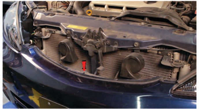
20) Reinstall [8x] T-15 torx screws to secure the fascia to the undertray.