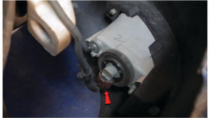
6) Disconnect the foglamp harnesses, then remove the fascia and set it aside.