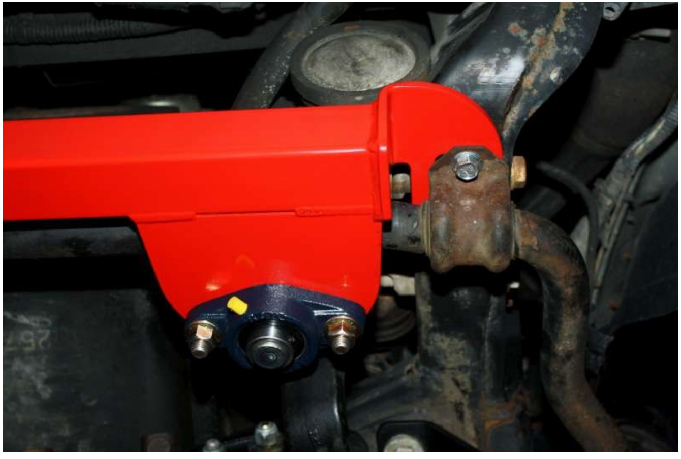
Check out the collection of performance steering parts we offer.