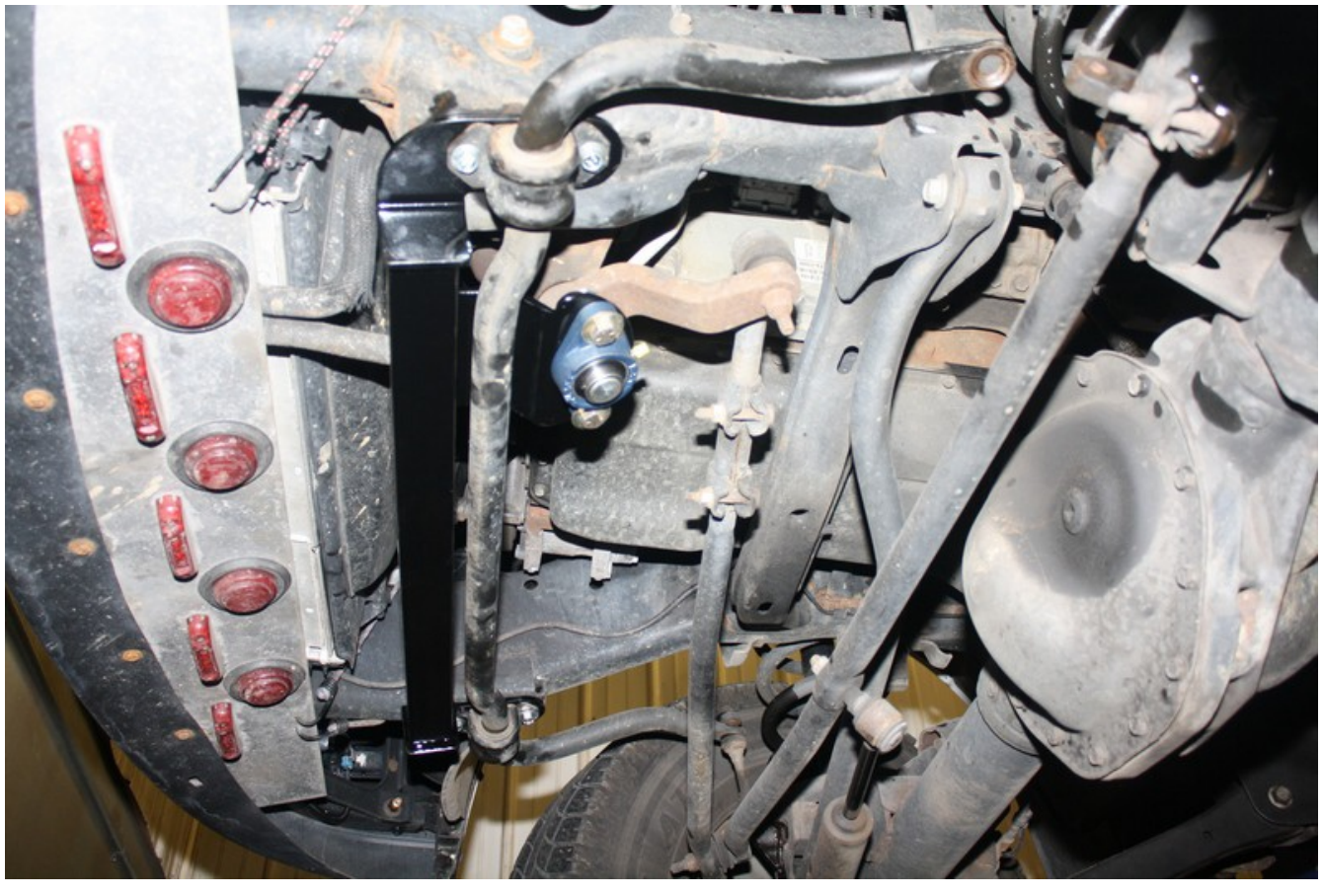
Check out the collection of performance steering parts we offer.