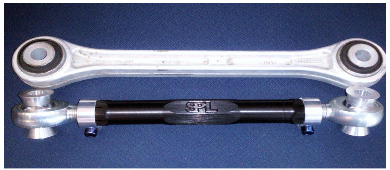
Try to match length of new link to that of old, center to center of the bores.