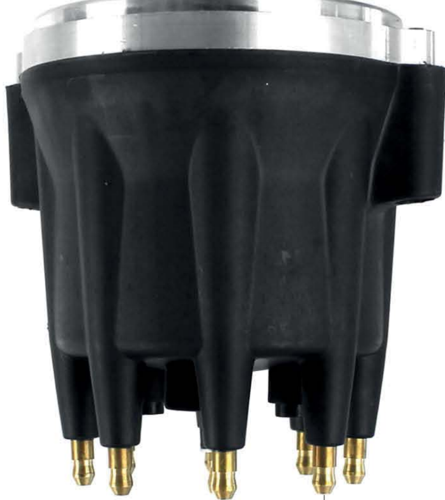
'spark plug' type terminals