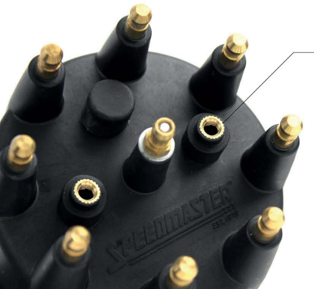
Metal Threaded Inserts