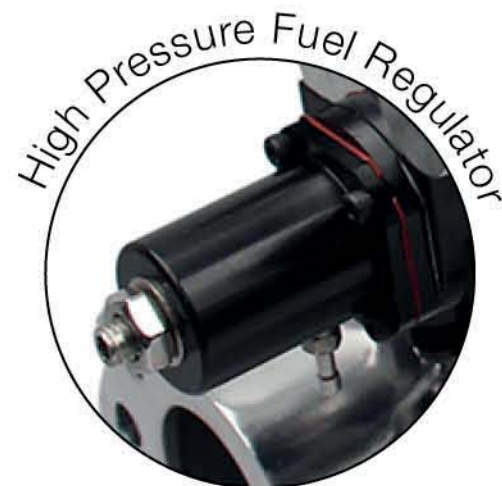
Total Fuel Control