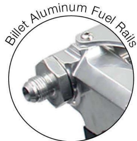
Increased Fuel Volume