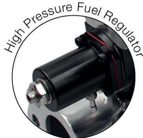
Total Fuel Control