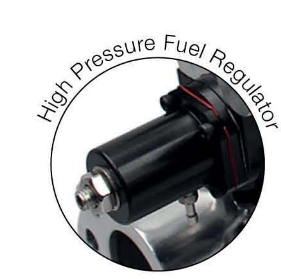
Total Fuel Control