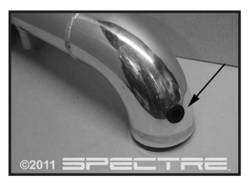
Step 13 Install the grommet into the tube.