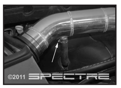
Step 16 Connect the new PCV breather line supplied in the kit to the new Spectre Performance intake tube. Once in place securely fasten with the clamp provided.