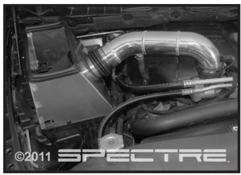
Step 18 Make sure that all clamps and hardware are fully tightened. Reconnect the battery cable and start the engine and let it warm up. Shut it off and inspect the installation once more for any loose clamps, wires, or hardware. Test drive & enjoy! Your installation is now complete. Periodically check all clamps and brackets.