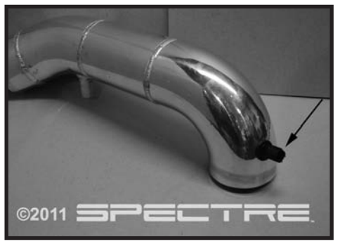
Step 14 Reinstall the factory IAT sensor.