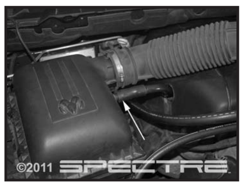
Step 3 Disconnect the PCV breather hose from the airbox lid.