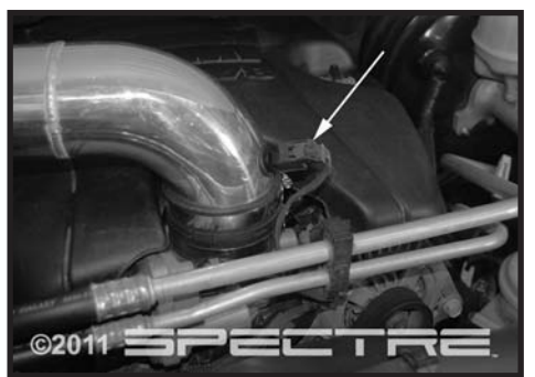
Step 17 Connect the IAT sensor by pushing the connector on the sensor. Once bottomed out, push the red clip towards the tube to lock in place.