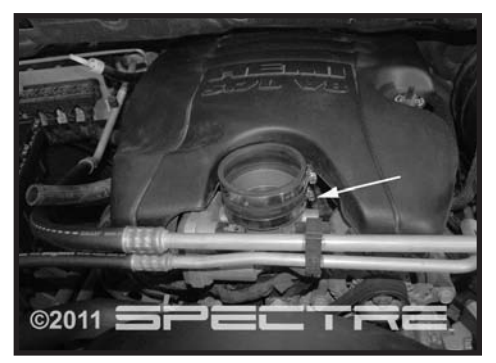
Step 9 Install the coupler onto the throttle body. Tighten the clamp on the throttle side and make sure the intake side clamp is installed but left loose.