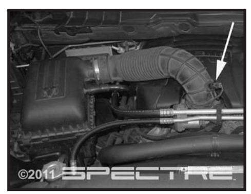
Step 2 Disconnect the IAT sensor connector.

Safety first! Before you begin the installation, make sure that the vehicle is in park (or neutral for a manual transmission) with the parking brake set. Disconnect the negative battery terminal and verify that all components that are listed are present. Note: This kit was designed and tested on a stock engine without any custom tuning done to the engine computer. Removing the battery cable may erase the programmed radio stations. The anti-theft code will need to be entered into some radios after the battery cable is connected. The anti-theft code can typically be found in the owner's manual or at your local dealership.