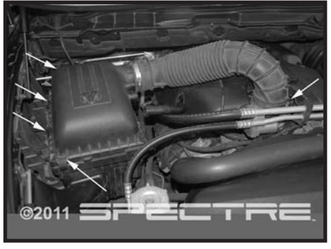
Step 4 Loosen the clamp on the tube going to the throttle body. Unclip the four hold down clips on the air filter lid. Remove the intake tube and airbox lid assembly from the vehicle. Remove the stock airfilter.