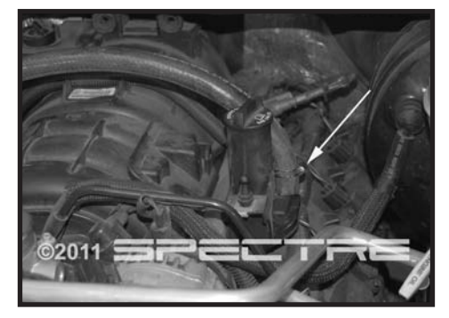
Step 7 Install the new PCV breather line supplied in the kit. Once in place securely fasten with clamp provided.