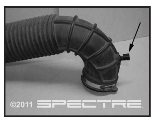
Step 12 Remove the IAT sensor from the factory intake tube.