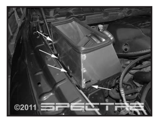
Step 11 Install the heat shield making sure that the slots on the heat shield are inserted into the lower factory airbox tabs. With the heat shield located in the tabs, using the 4 factory clips from the airbox, clip heat shield into position.