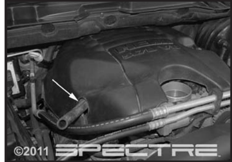
Step 8 Reinstall the engine cover. Make sure the new PCV breather line fits into notch on the engine cover.