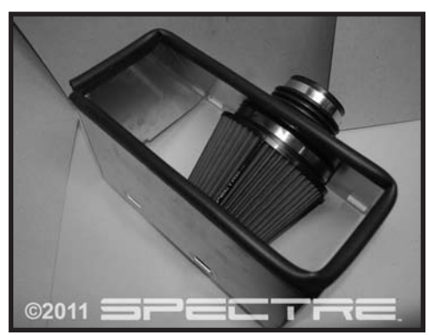
Step 10 Place the velocity stack adapter in the heat shield and install the supplied flex boot making sure the coupler is pushed completely against the heat shield. Once the adapter and coupler are tight against the heat shield, tighten the clamp. Make sure that the clamp for the intake tube is installed but left loose at this time. Install the air filter and dress the heat shield with rubber seal.