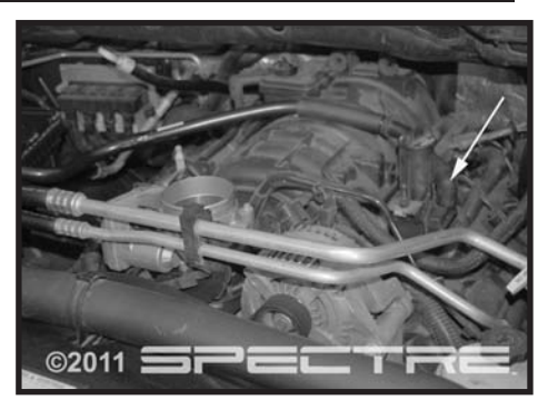
Step 6 Disconnect the factory PCV breather hose from the engine.