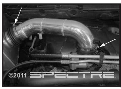
Step 15 Install the Spectre Performance intake tube into the throttle body coupler and then into the coupler on the heat shield. Once in position fully tighten the clamps.