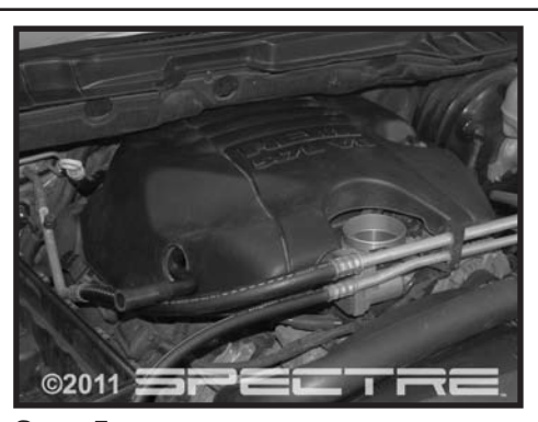
Step 5 Remove the engine cover.