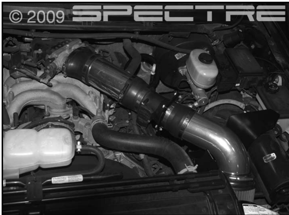
Step 21 Gently close the hood and check to make sure the intake assembly does not come in contact with the hood when closed. Make any adjustments if necessary. Reconnect the negative terminal on the battery. Start up the engine and check for any air leaks. Your installation is now complete. Affix carb E.O. sticker in a prominent place under the hood. Periodically check all clamps and brackets. Enjoy your Spectre Intake System.

Product Info: Performance Air Induction System P/N 9921