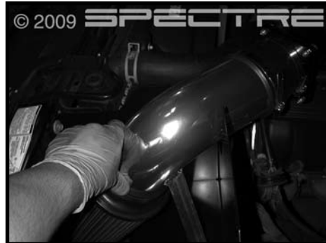
Step 19 Insert the lower intake tube to the MAF sensor assembly.