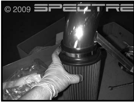
Step 18 Attach the air filter to the lower intake tube.