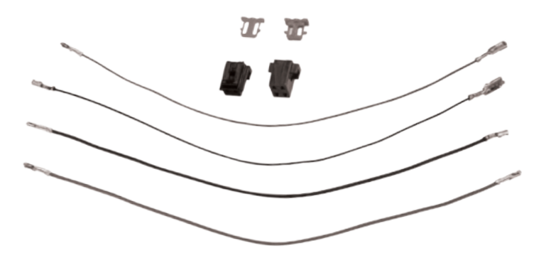
Wiring kit for pump and fuel level sender

Flange and pump connector with terminal lock