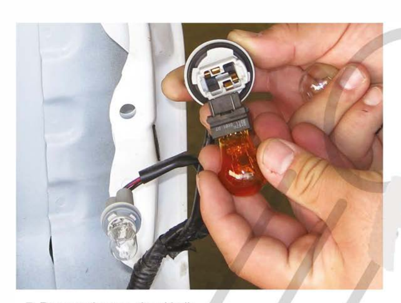
7. Remove the turn signal bulb