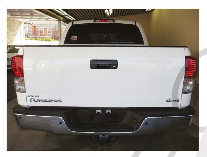
1. Stock tailights 2. 2 T30 bolts location