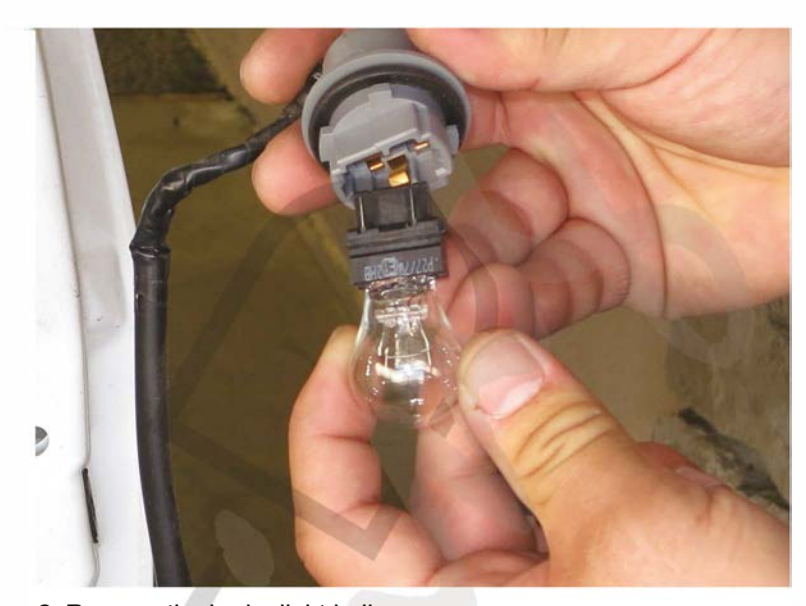
6. Remove the brake light bulb please see the "L.E.D. tail lights installation instructions" If your tail lights don't have L.E.D. you can skip the installation instructions.