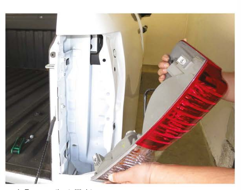
4. Remove the taillight