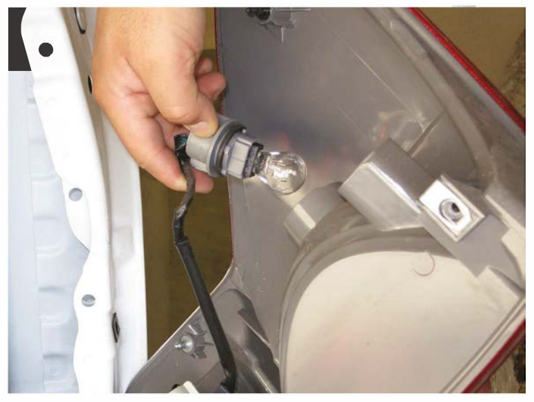
5. Remove the light sockets