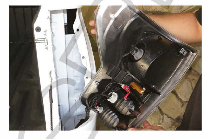
9. Place the LED tailight in stock location and tighten (2) T30 bolts