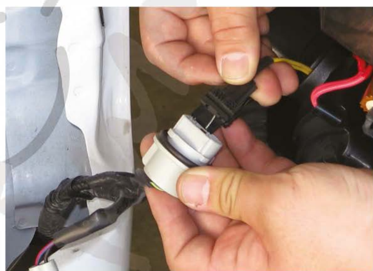
8. Connect the taillight harness to LED taillight