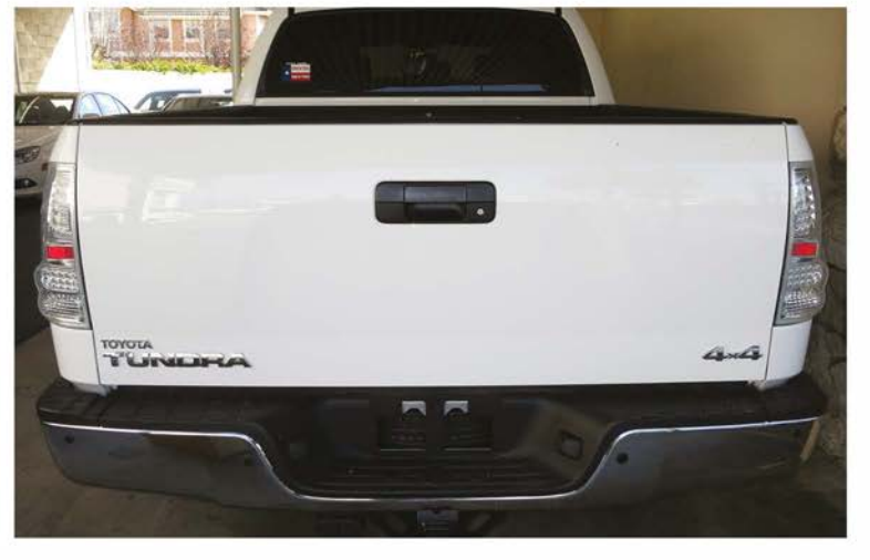
10. Please repeat the steps in order from 1 to 9 for the opposite side. The installation now is complete \frac{1}{2}