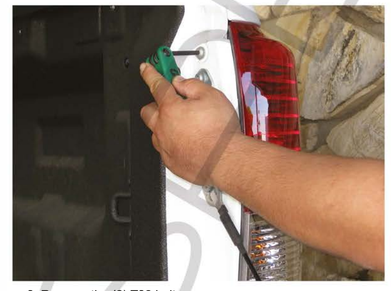
3. Remove the (2) T30 bolts