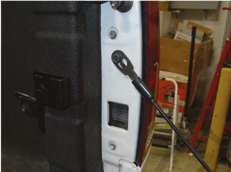
1. (2) 10mm bolts location