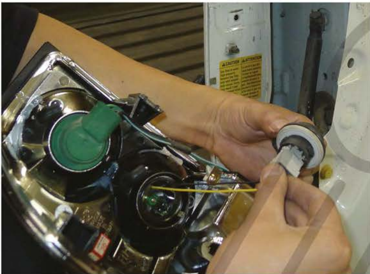
13. Connect the LED taillight harness to the taillight socket