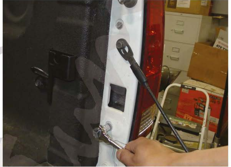
2. Remove the (2) 10mm bolt