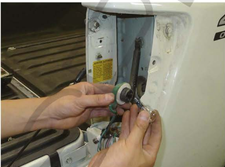
9. Remove the brake light bulbs