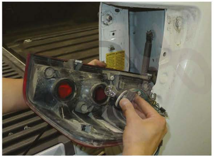
6. Remove the brake light sockets