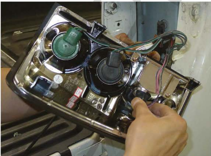
15. Install the taillight socket into the LED taillight