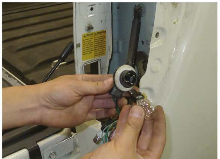
10. Remove the brake light bulb