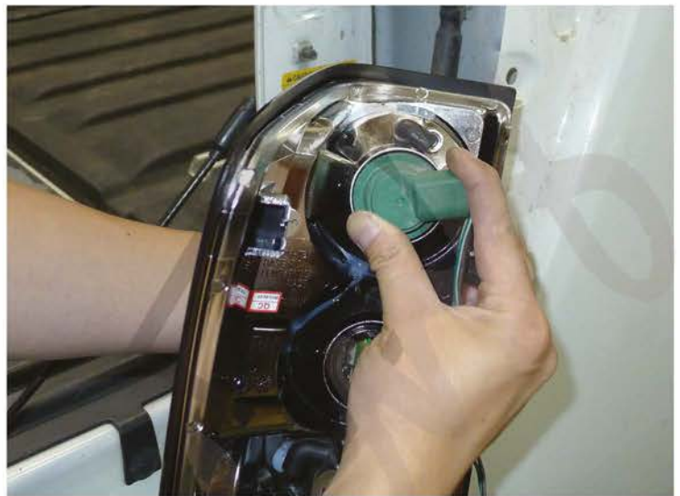
12. Install the taillight socket to the LED taillight housing