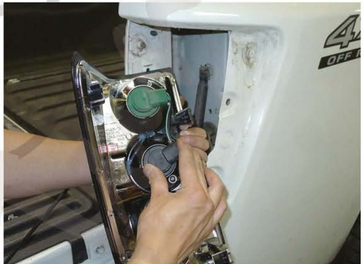
14. Install the taillight socket into the LED taillight