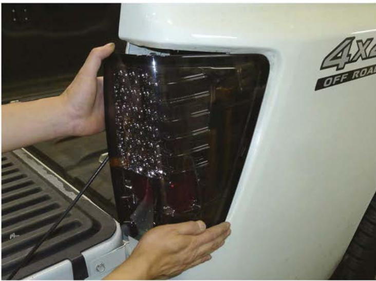
17. Place the LED taillight in the stock location please see the "L.E.D. TAIL LIGHT installation instruction" If your Tail light don't have L.E.D. You can skip the the installation instruction.