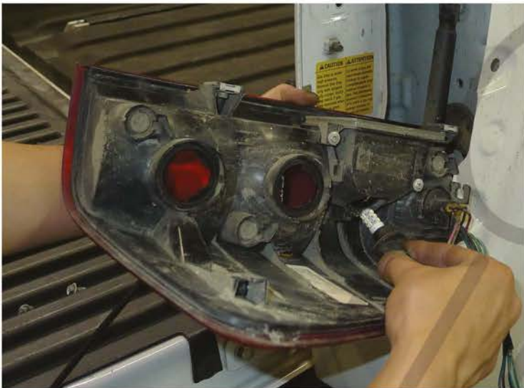
7. Remove the brake light sockets