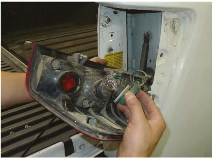
6. Remove the brake light sockets