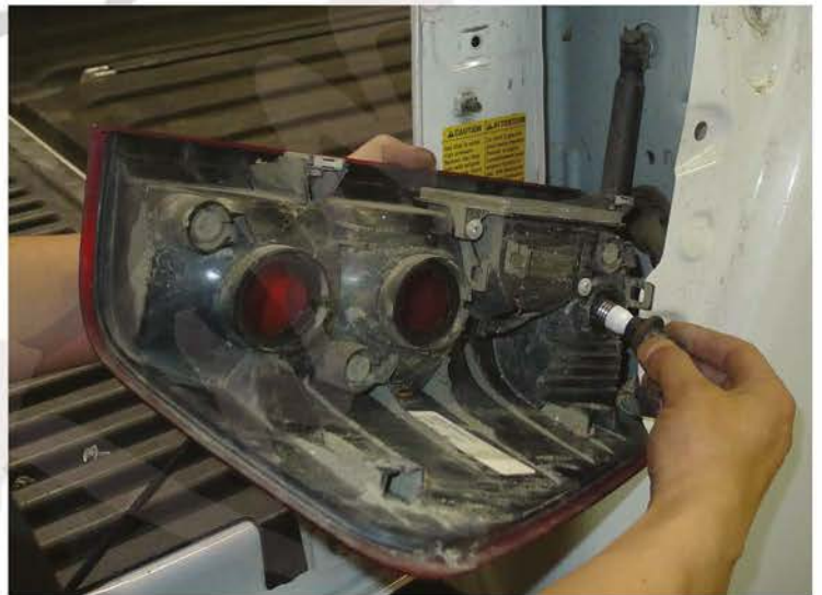
8. Remove the brake light sockets