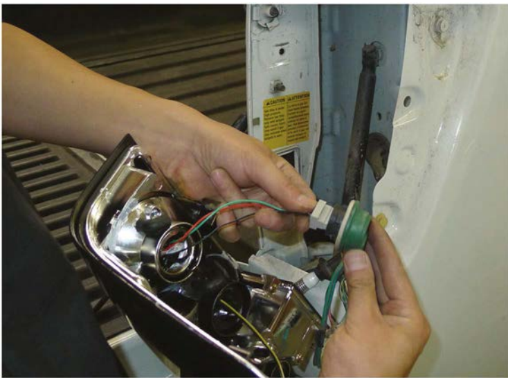
11. Connect the LED taillight harness to the taillight socket please see the "L.E.D. TAIL LIGHT installation instruction" If your Tail light don't have L.E.D. You can skip the the installation instruction.