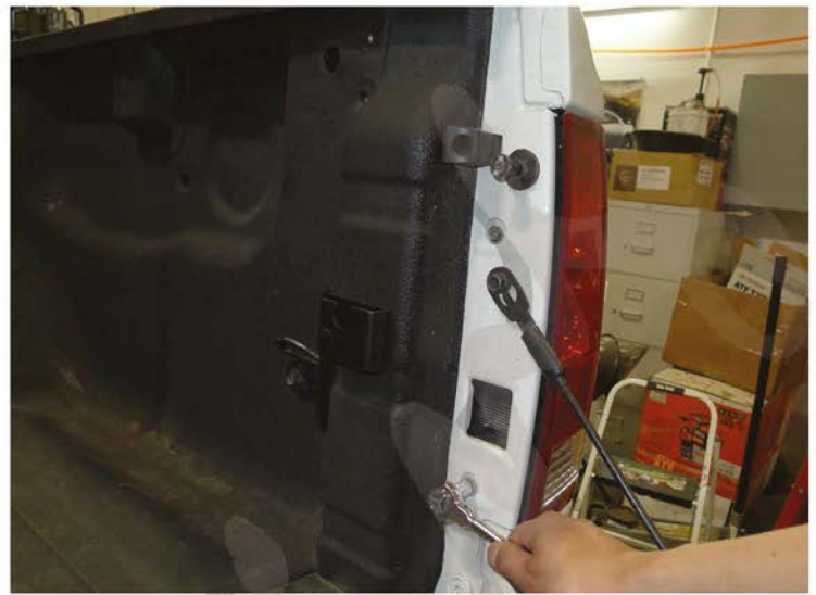
18. Tighten the (2) 10mm bolts