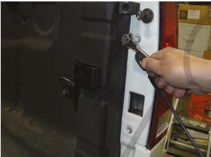
19. Tighten the (2) 10mm bolts Please repeat the picture order from 1 to 19 for the opposite side