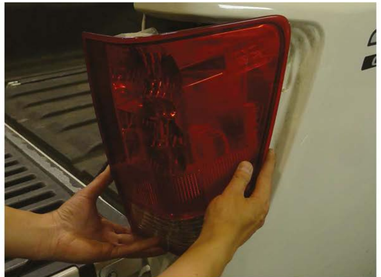
5. Remove the factory taillight