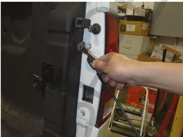
3. Remove the (2) 10mm bolts