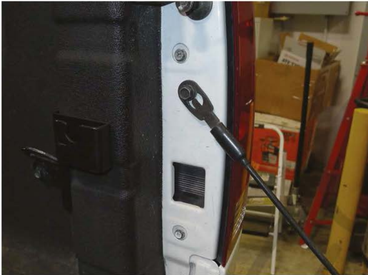
1. (2) 10mm bolts location