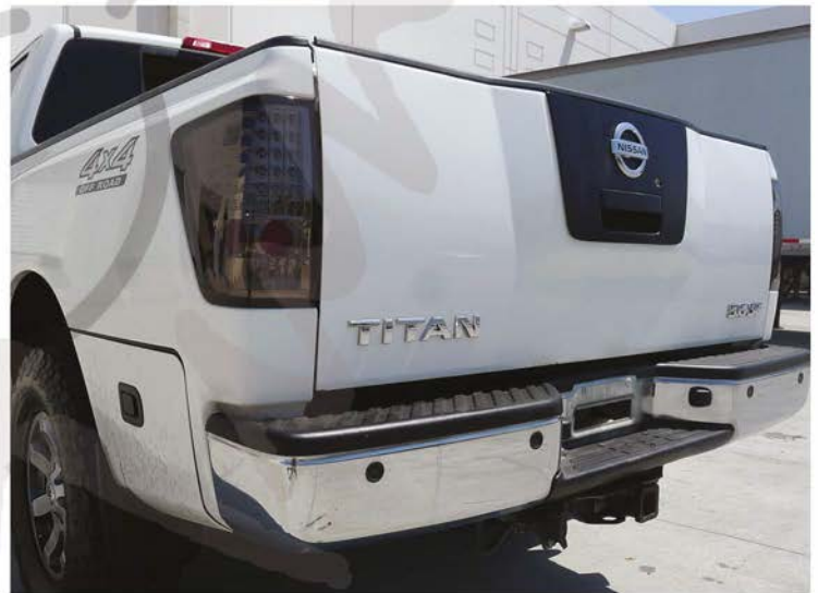
20. The installation now is complete