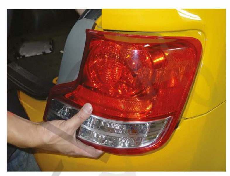
6 Remove the factory taillight