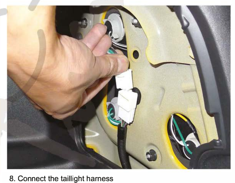
Please see the "L. E. D. tail lights installation instructions" If your tail lights don't have L. E. D. you can skip the installation instructions.