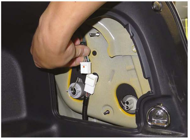
5. Disconnect the taillight harness