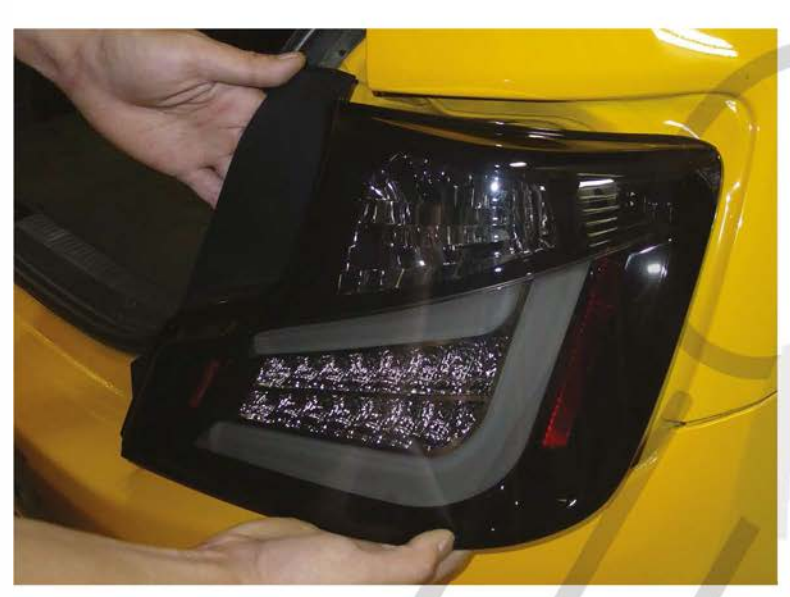
7. Place the LED taillight in the stock position