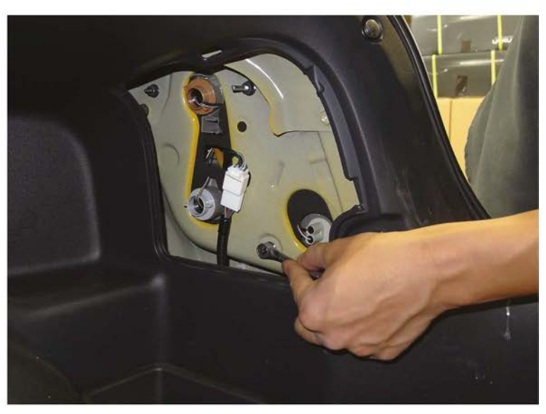
4. Remove the (3) 10mm nuts