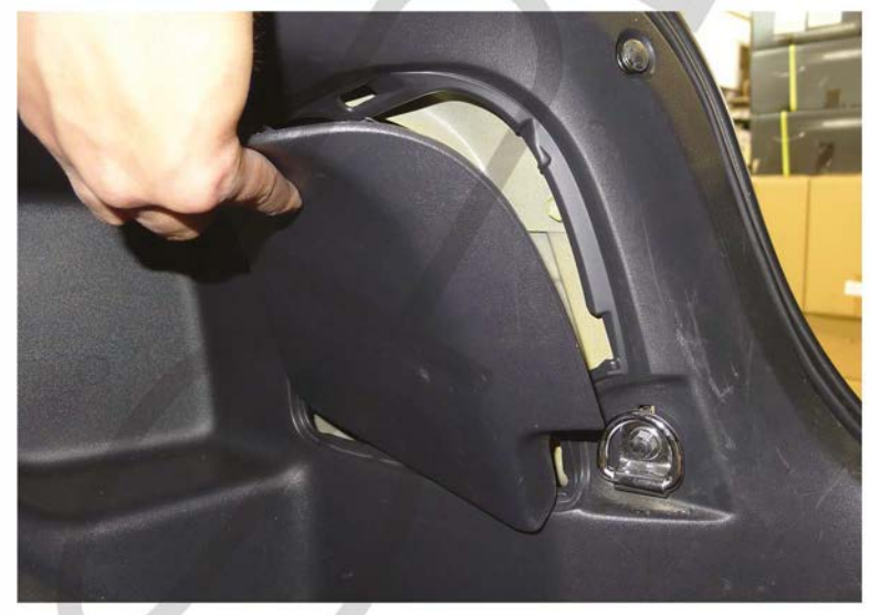
9. Replace the access hole cover.