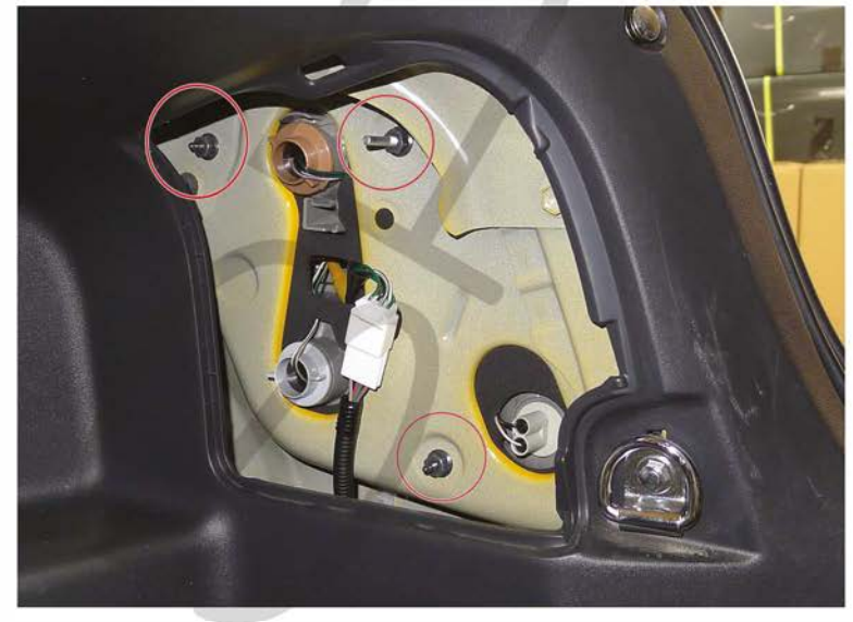
3. 10mm nuts location