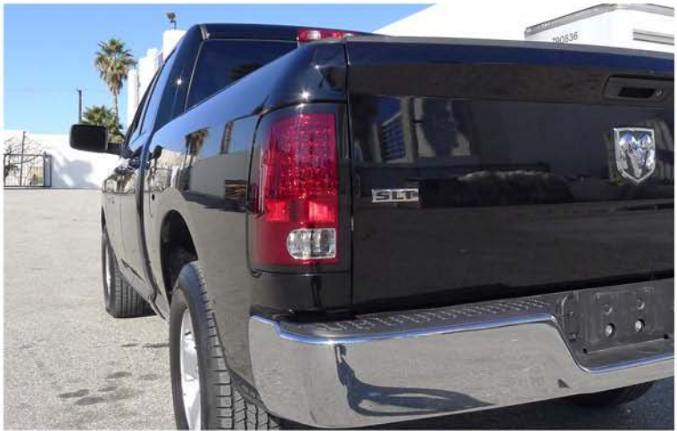
10. Please repeat the steps in order from 1 to 9 for the opposite side. The installation is now complete