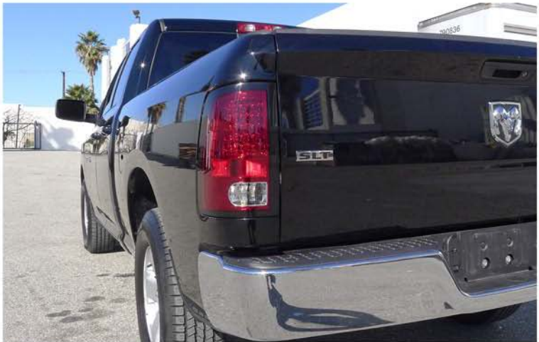
10. Please repeat the steps in order from 1 to 9 for the opposite side. The installation is now complete