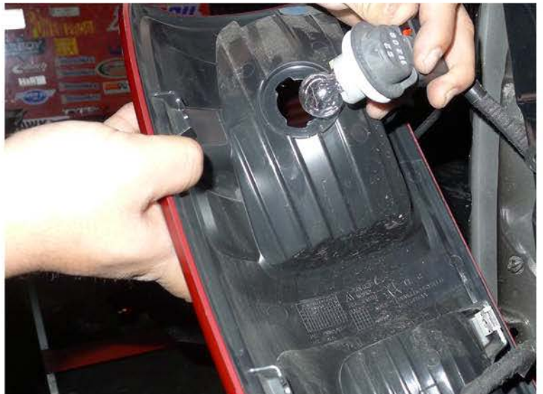
4. Remove the taillight sockets