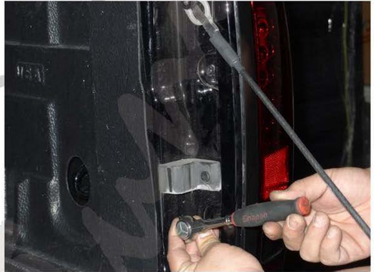
2. (2) T15 screws locations and remove the (2) T15 screws