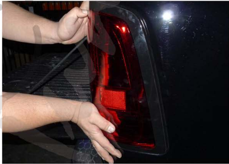
8. Place the LED taillight in the stock location