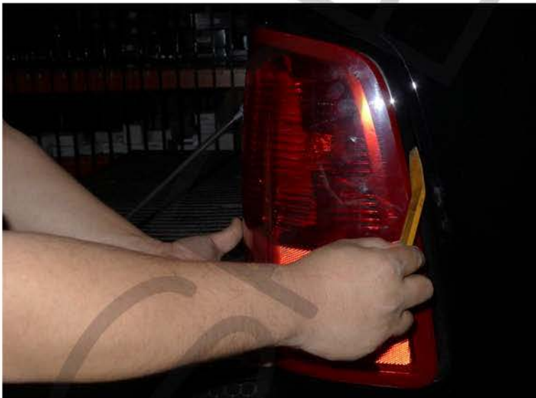
3. Remove the factory taillight