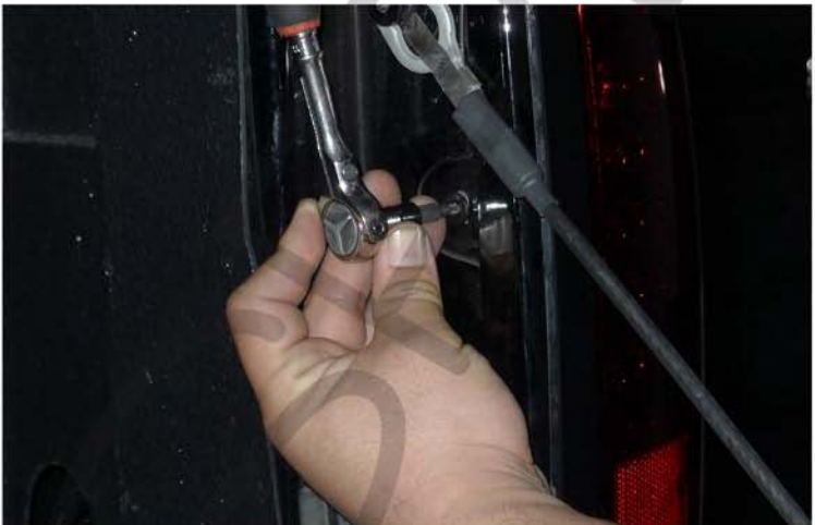
9. Tighten the (2) T15 screws