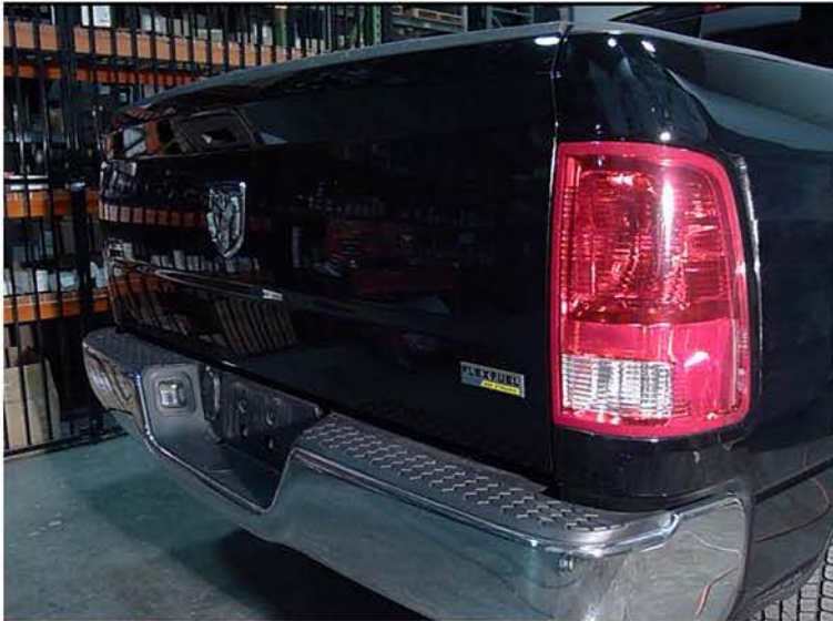
1. Stock light