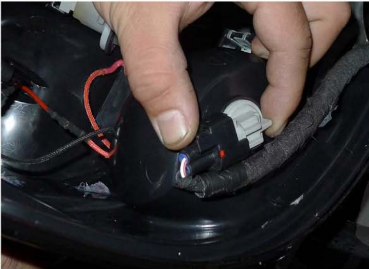
7. Connect the brake light harness to the LED taillight

please see the " L.E.D. tail lights installation instructions" If your tail lights don't have L.E.D. you can skip the installation instructions.