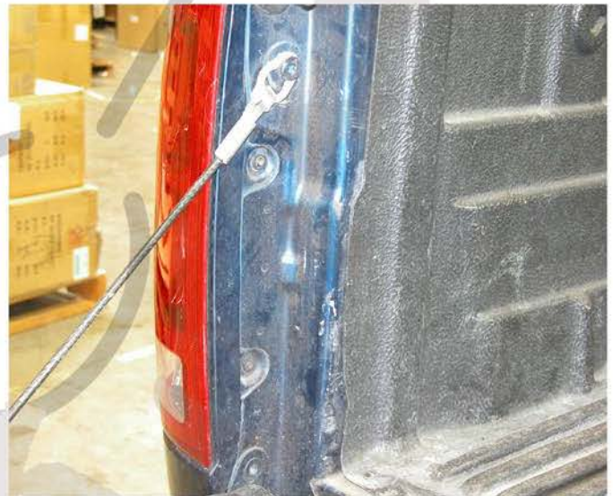
2. Remove two T20 bolts