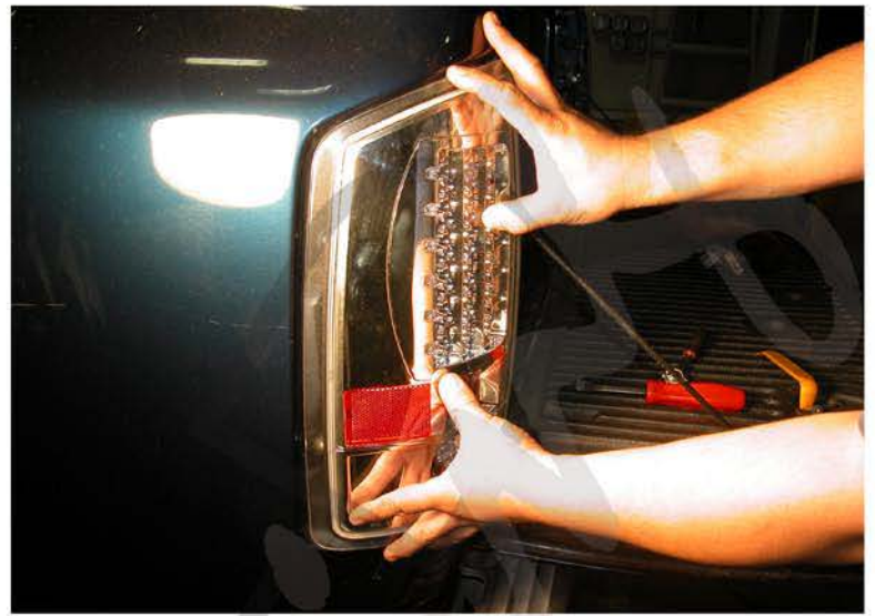
6. Install taillight