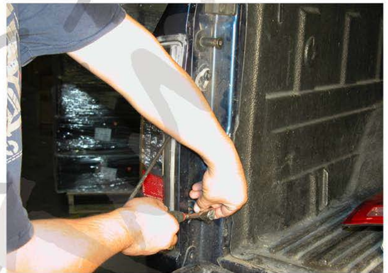
8. Please repeat the picture order from 1 to 8 for the opposite side