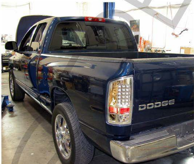
9. The installation is now complete