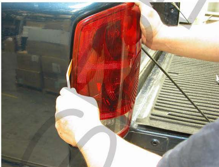
3. Remove the taillight