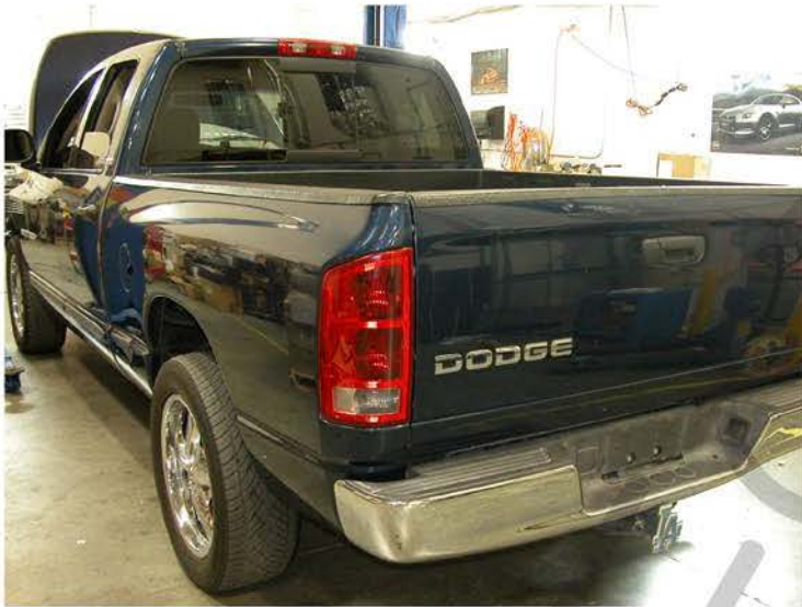
1. Open the tail gate

If you experience any difficulties that the instruction did not cover, Please seek local auto shop for advise. Please wear protection before you work on your vehicle. An assistant is helpful when removing the front bumper. Please be careful while working with the bumper or body part to avoid scratching. Do not make direct contact with the halogen bulb or the wire assembly until the unit has cooled down after use.