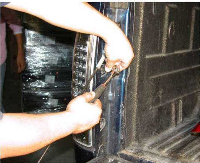
7. Install two T20 bolts