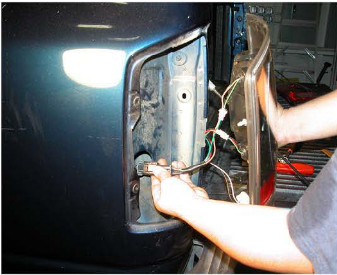
5. Connect all the connectors