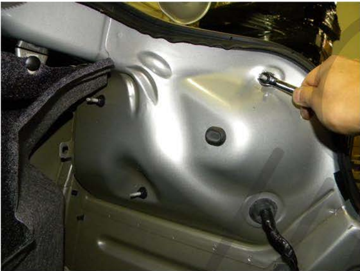
7. Remove the (3) 10mm nuts