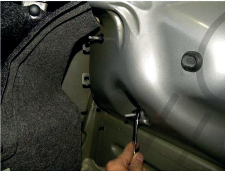
13. Tighten the (3) 10mm bolts