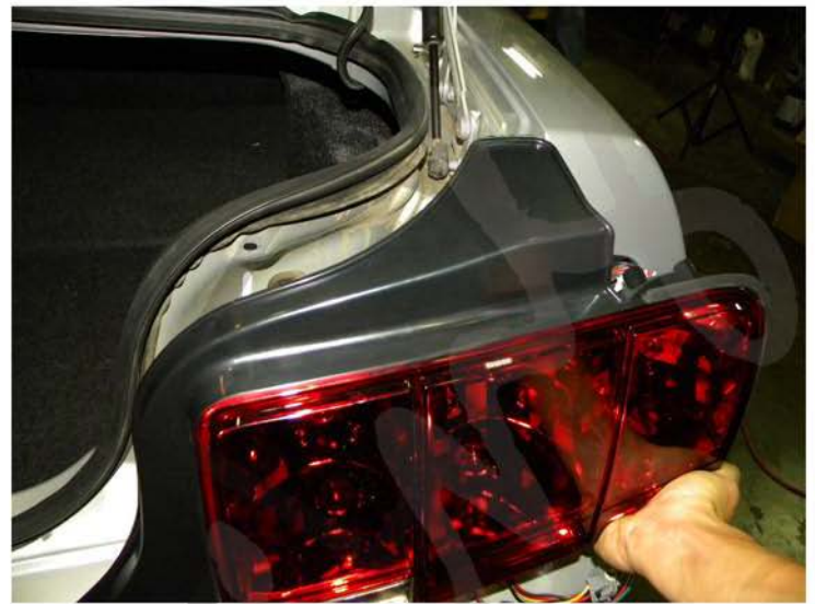
12. Place the sequential tail light into position