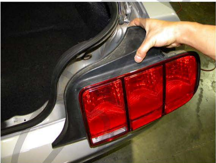
9. Remove the stock tail light