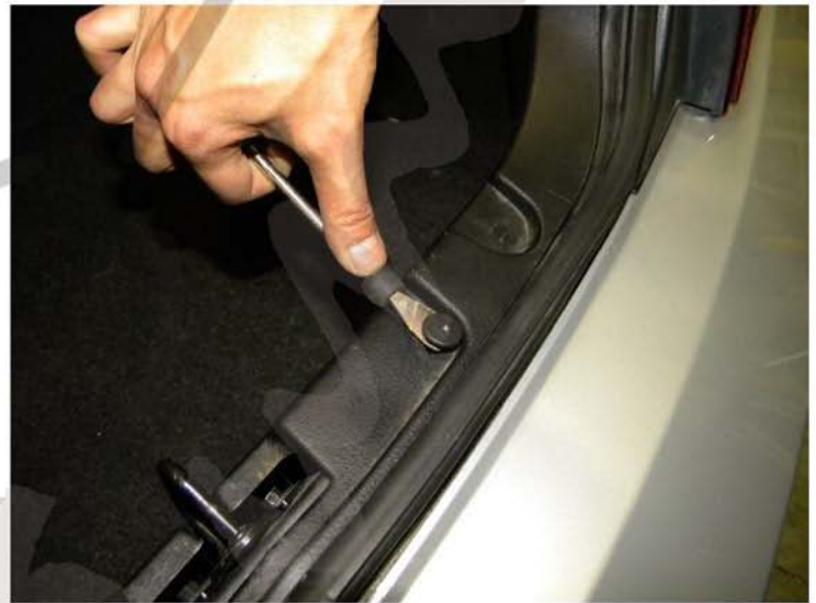
2. Remove the (6) plastic clips