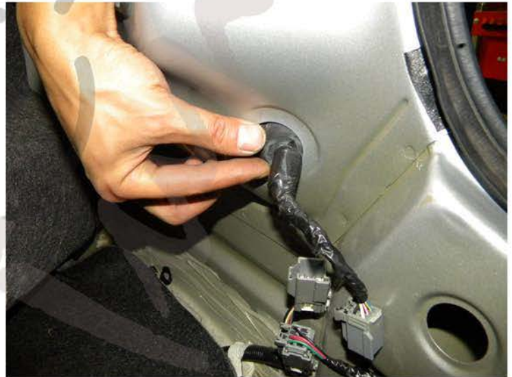
8. Push in the harness rubber seal