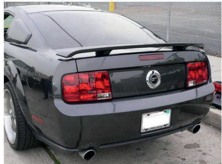
16. Please repeat the steps in order from 1 to 15 for the opposite side. The installation is now complete