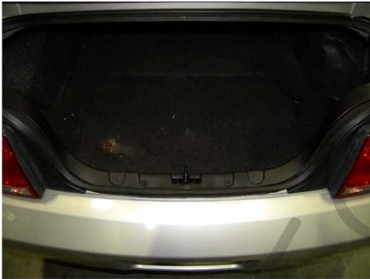
1. Open the trunk, to access the plastic trunk moulding

Do not make direct contact with the halogen bulbs or the wire assembly until the unit has cooled down after use.