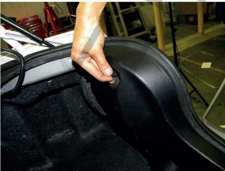
15. Replace the (6) plastic clips