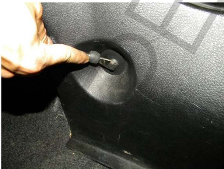
3. Remove the (6) plastic clips