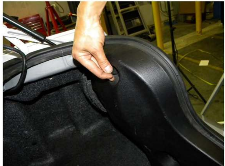
4. Remove the (6) plastic clips