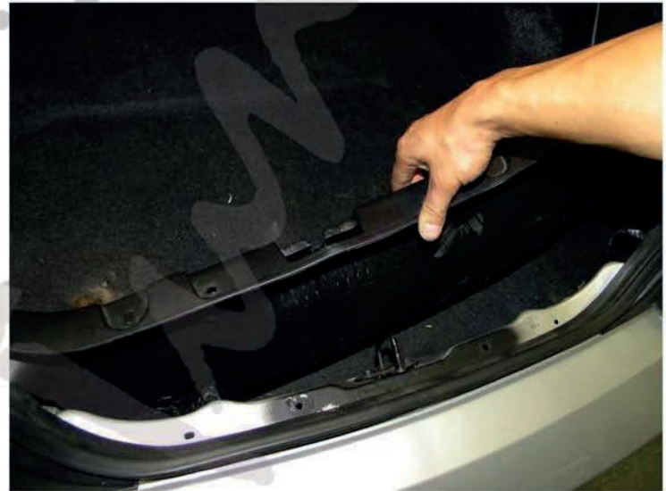
14. Replace the plastic trunk moulding