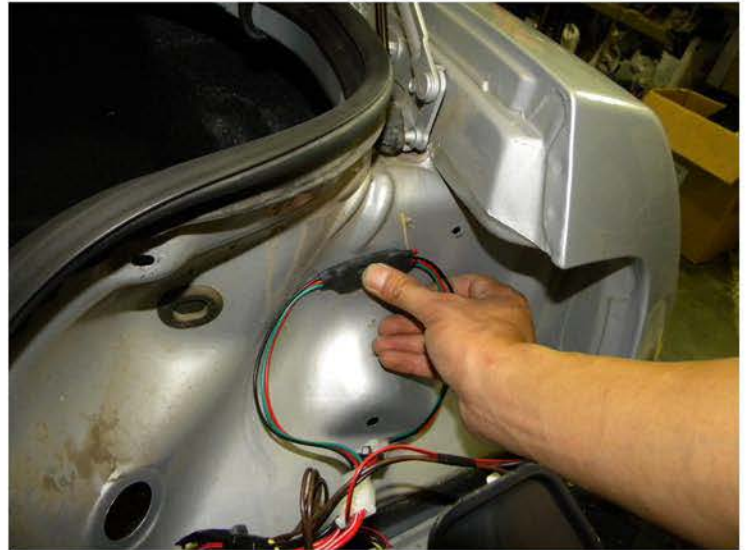
10. Secure the harness to the bodywork with double sided foam tape