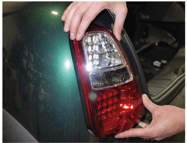
6. Place the LED taillight in the factory location