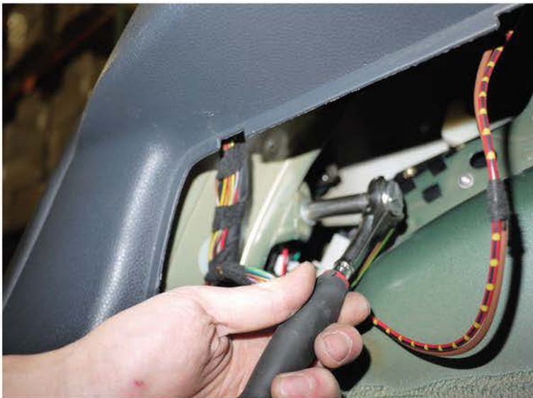
7. Tighten the 10mm nut