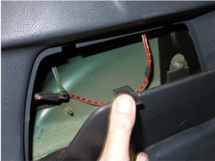
1. Remove the access panel