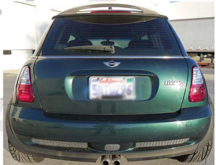
8. Please repeat the steps in order from 1 to 7 for the opposite side