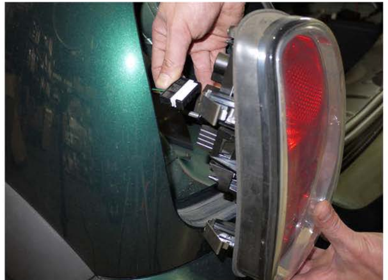
4. Disconnect the factory taillight