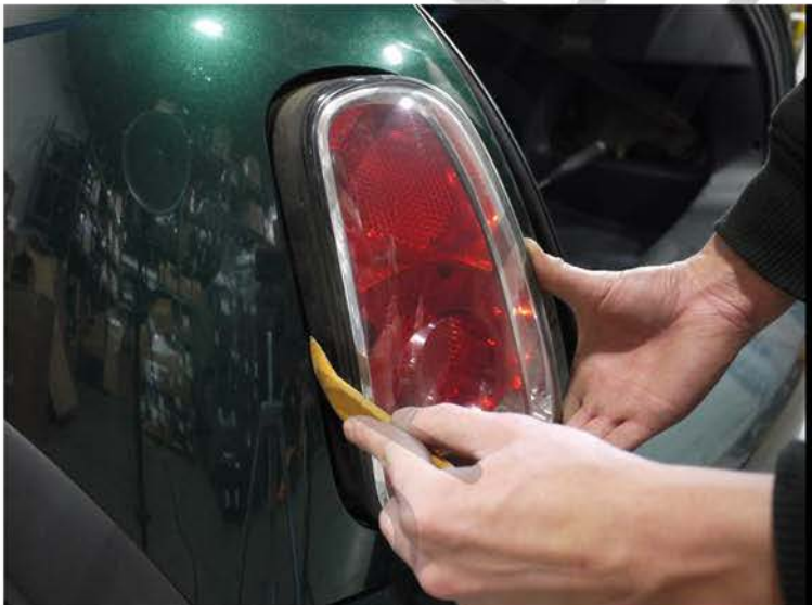
3. Remove the factory taillight