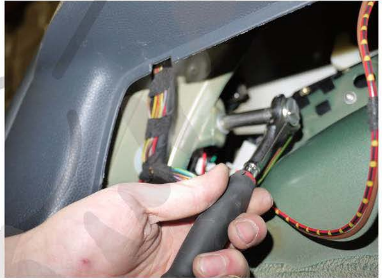
2. Remove the 10mm nut