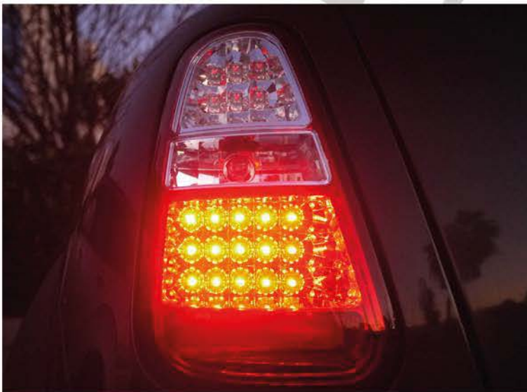
9 The installation is now complete