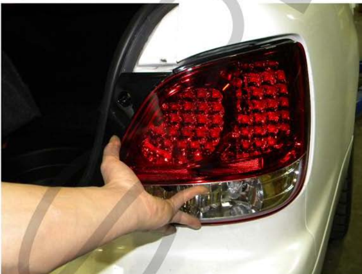
9. Place the LED tail light in the stock location