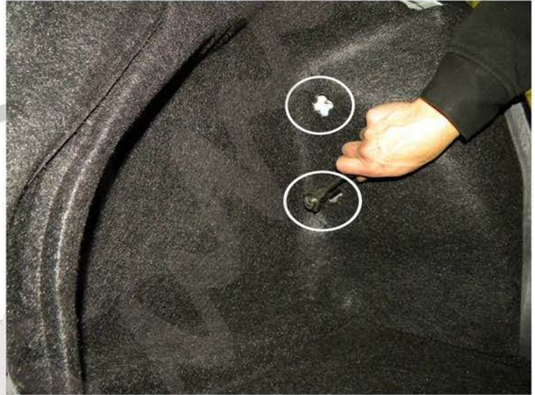
2. Remove the (2) 10mm nuts