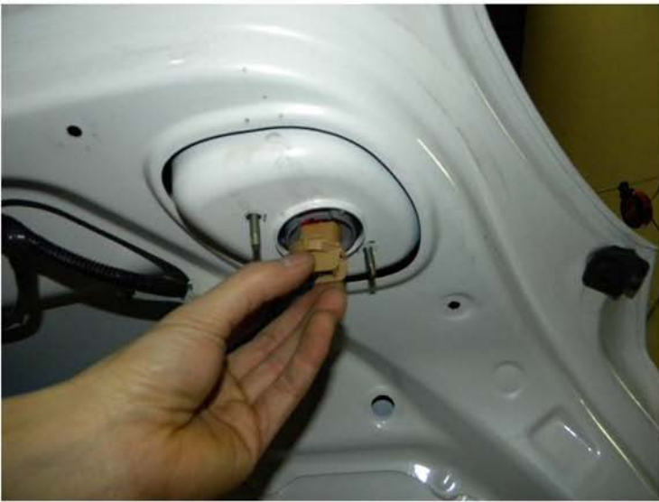
17. Remove the light socket