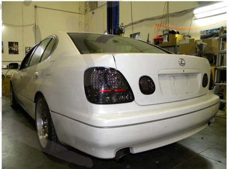
26. The installation is now complete