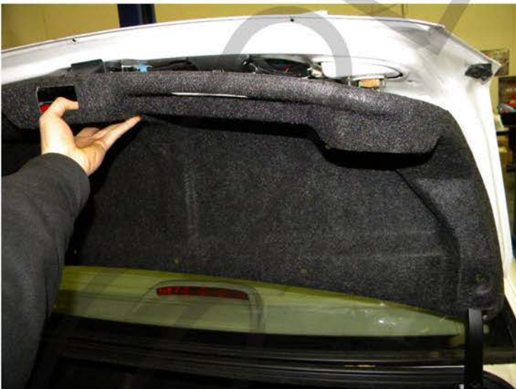
15. Remove the trunk liner