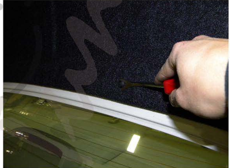
14. Remove the (14) plastic clips