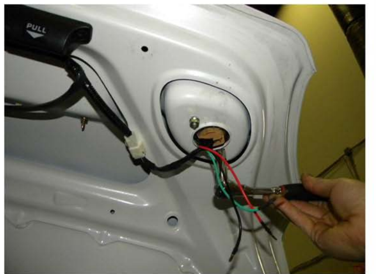
22. Tighten the plastic nut