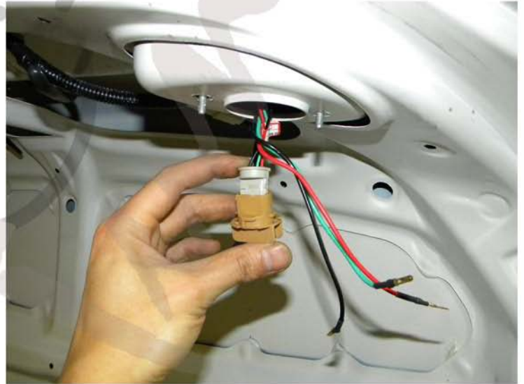
20. Plug the LED tail light in the light socket