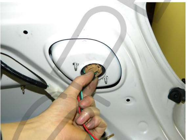
21. Plug in the tail light socket