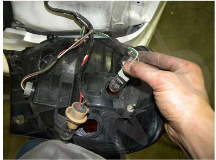
6. Remove the tail light harness