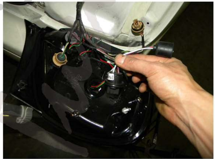
8. Connect this harness adapter for the 2001-2005 model

please see the "L.E.D. tail lights installation instruction" If your tail lights don't have L.E.D. You can skip the installation instruction.