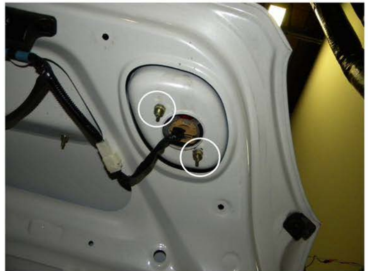
16. Remove the (2) 10mm nuts