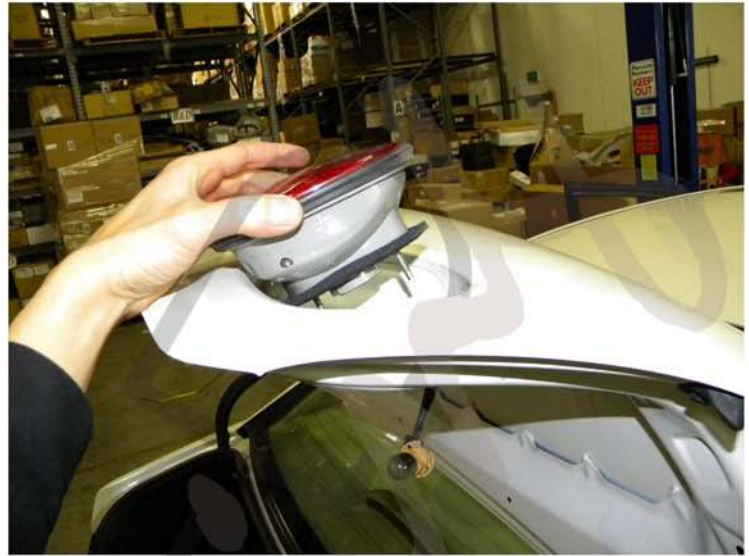
18. Remove the stock tail light