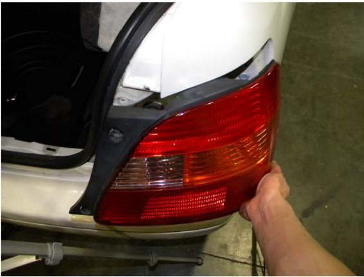
5. Remove the tail light