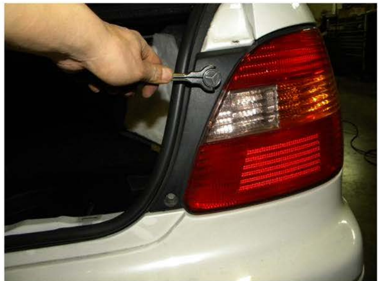
4. Remove the (2) 10mm bolts