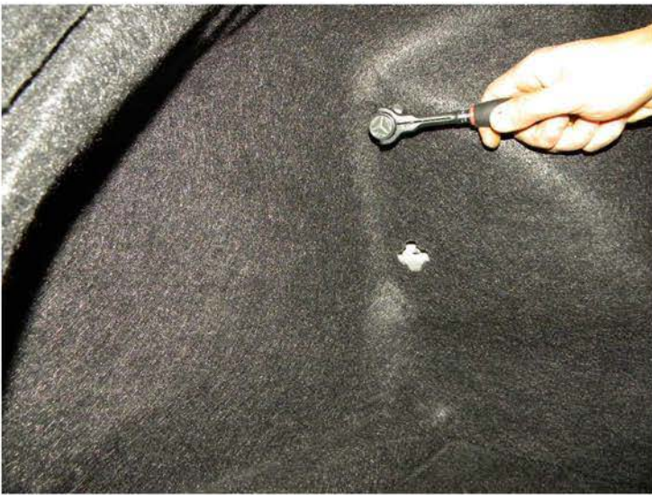
11. Tighten the (2) 10mm nuts