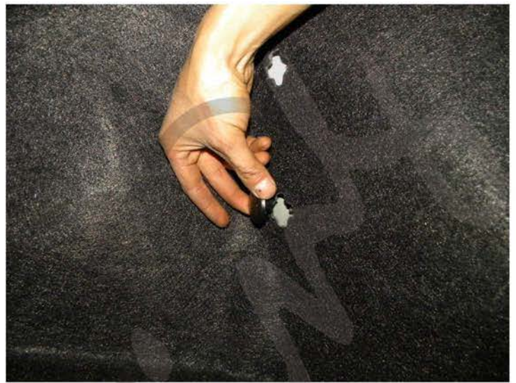
12. Replace the plastic covers