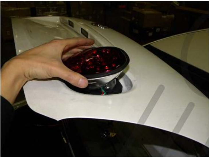
19. Place the LED tail light in the stock location