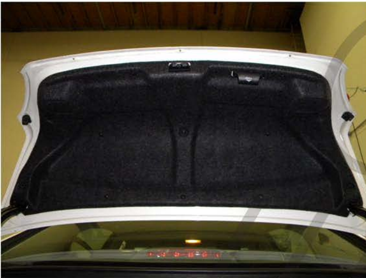
13. (14) plastic clips location