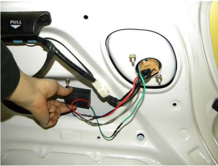
23. Connect the resistor and attach to the trunk