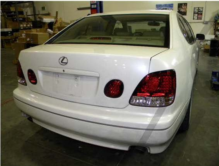
25. Please repeat the steps in order from 1 to 24 for the opposite side