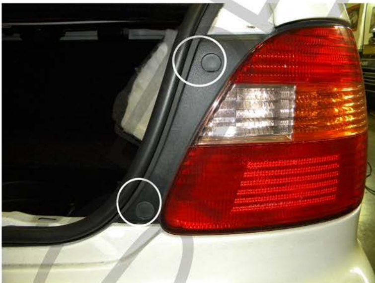
3. Remove the plastic cover