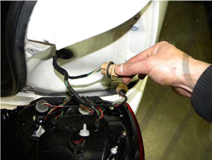
7. Connect the socket with the shorter wire to the outer LED connector

please see the "L.E.D. tail lights installation instruction" If your tail lights don't have L.E.D. You can skip the installation instruction.