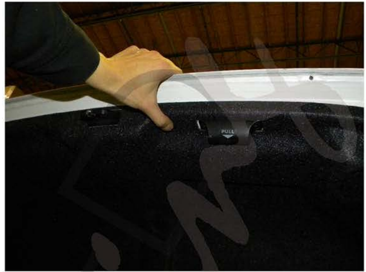
24. Replace the trunk liner and the (14) plastic clips