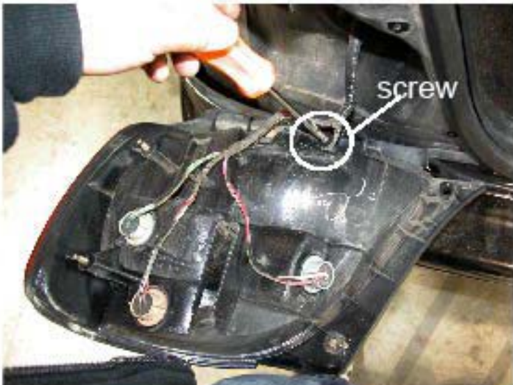
7. Remove the screw on the OEM tail light