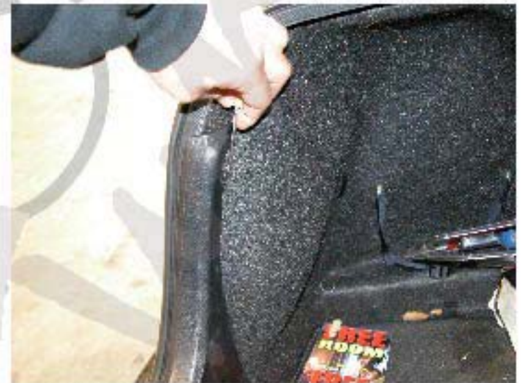
14. Put the plastic cover back into place