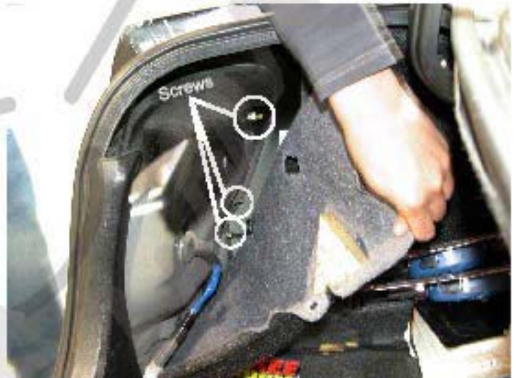
2. Open the plastic cover Inside the plastic cover, there are three screws