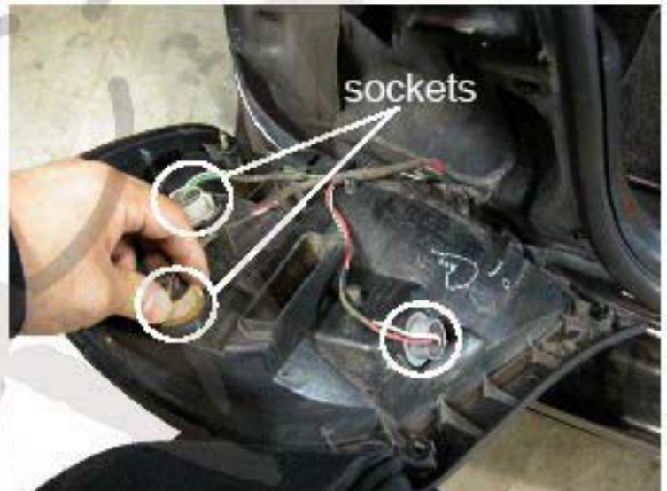
8. Remove all the sockets by turning them counter clockwise to unlock them