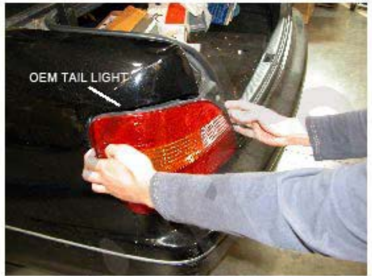
6. Gently pull out the OEM tail light slightly, just enough to see the back of the lights