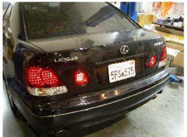
16. The installation now is complete