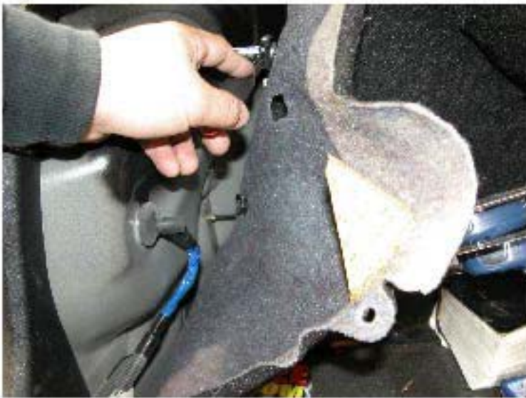
5. Remove the three screws which are inside the plastic cover shown earlier