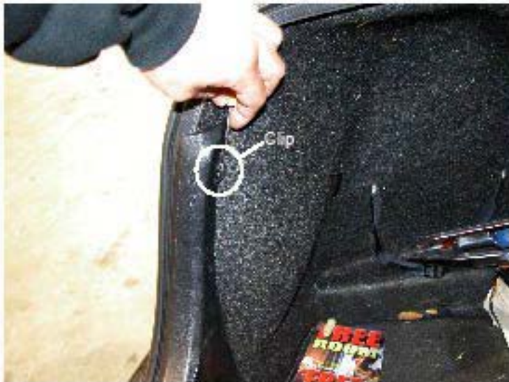
1. Remove the clip