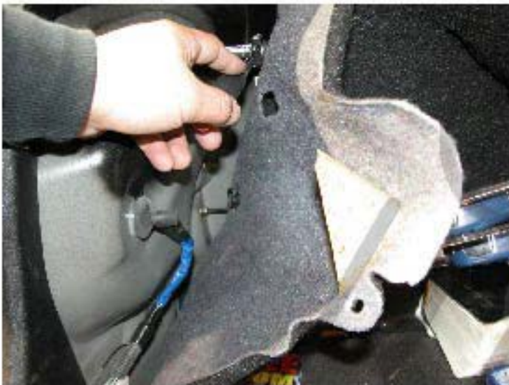
13. Install the three screws to fasten the tail light