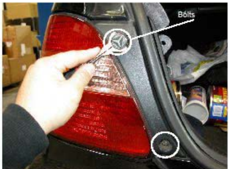
4. Then remove two bolts