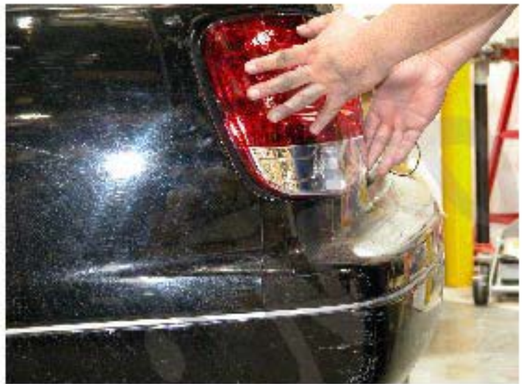
12. Gently put the L.E.D. tail light back into vehicle