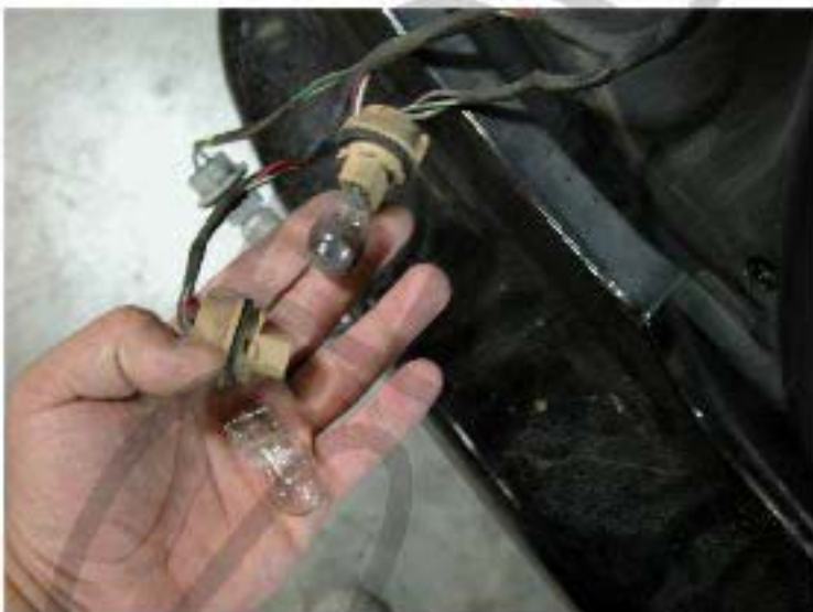
9. Remove the three bulbs from the sockets