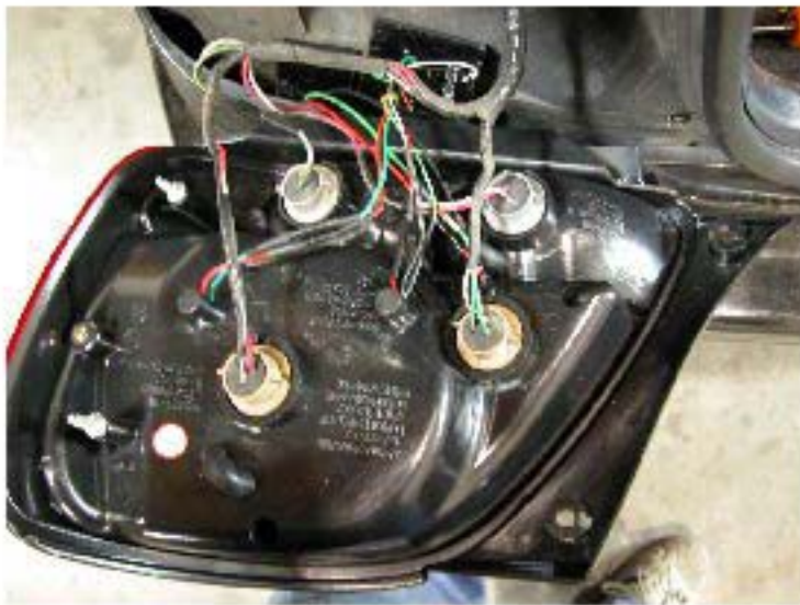
11. Replace the sockets back into the L.E.D. Tail light please see the "L.E.D. TAIL LIGHTS installation instructions" if your Tail lights don't have L.E.D. You can skip the installation instructions.