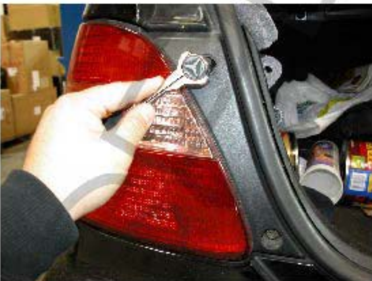
15. Install the two bolts (Please repeat the picture order from 1 to 15 for the opposite side)