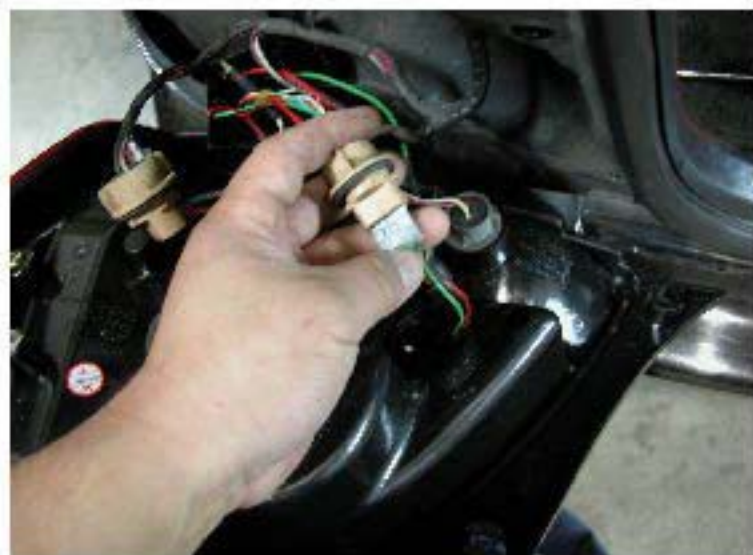
10. Plug the male harness from the L.E.D. tail light to the vehicle sockets by gently pushing them in for a snug fit