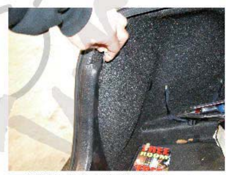
14. Put the plastic cover back into place