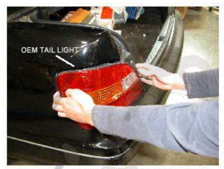
Gently pull out the OEM tail light slightly, just enough to see the back of the lights