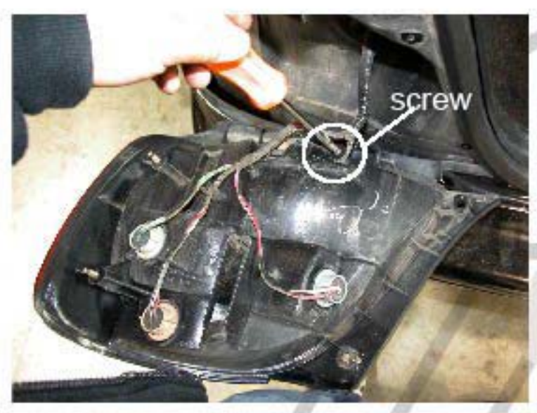
7. Remove the screw on the OEM tail light