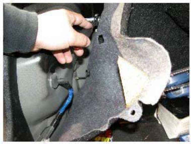
Remove the three screws which are inside the plastic cover shown earlier