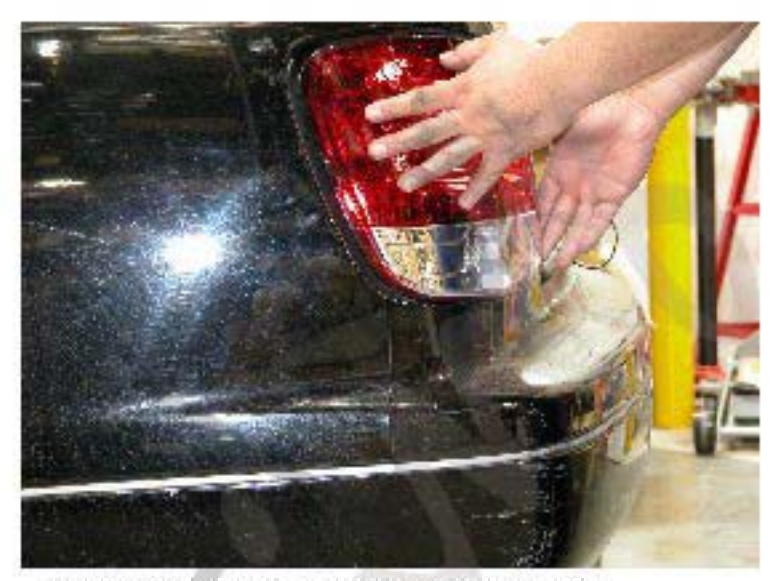
12.Gently put the L.E.D. tail light back into vehicle