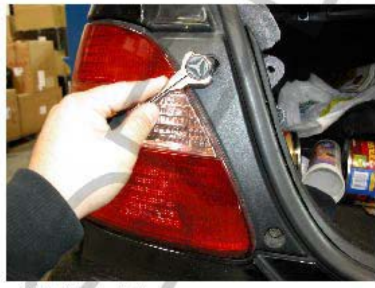
15.Install the two bolts (Please repeat the picture order from 1 to 15 for the opposite side)