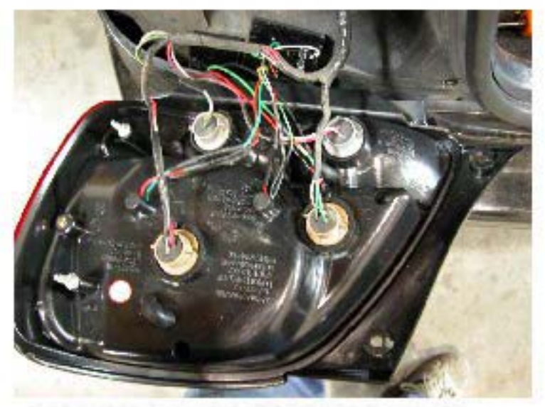
11. Replace the socket back into the L.E.O. Tail light please see the 5.E.D. TAIL LIGHTS installation instructions if your Tail lights don't have L.E.D. You can skip the traduition instructions.