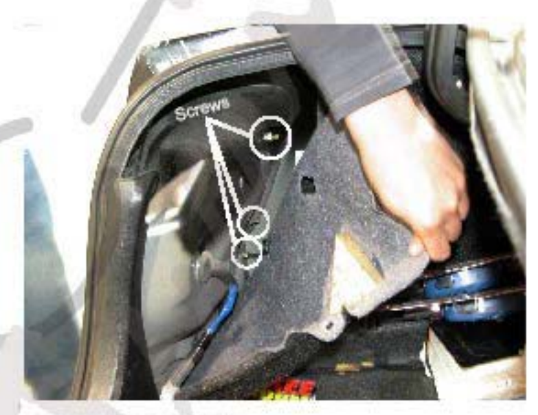
2. Open the plastic cover Inside the plastic cover, there are three screws