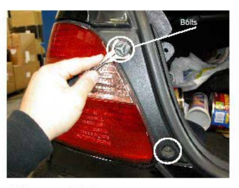
4. Then remove two botts