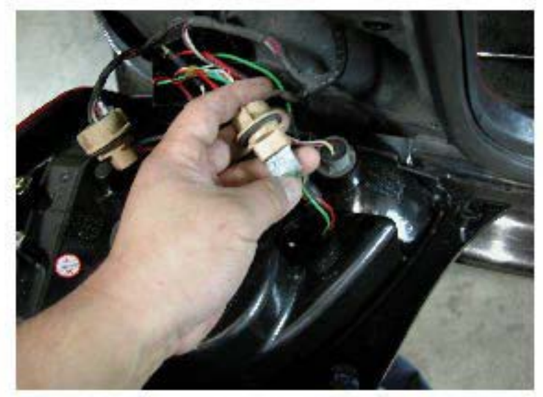
10. Plug the male harness from the L.E.D. tail light to the vehicle sockets by gently pushing them in f a snug fit