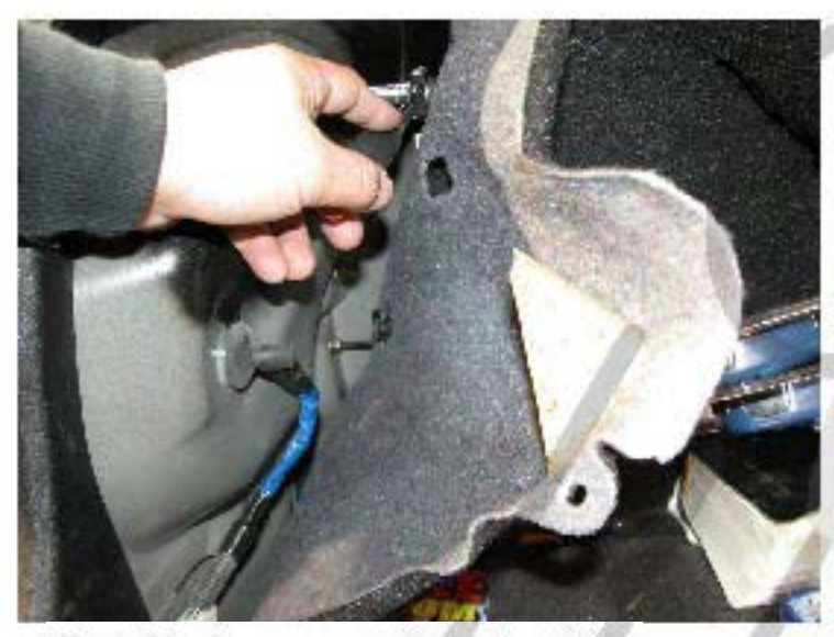
13.Install the three screws to fasten the tail light