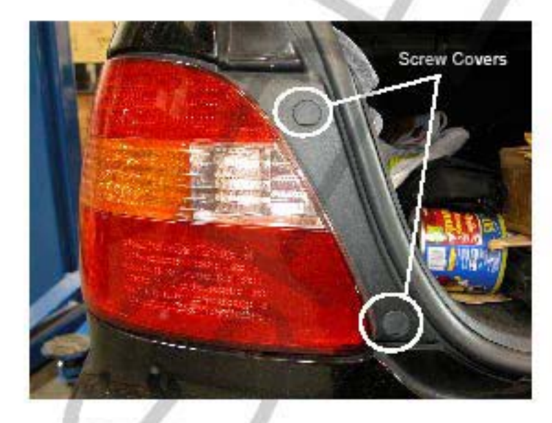
3. Remove two sciew covers