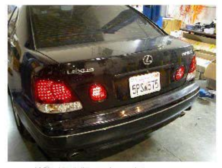
16. The installation now is complete