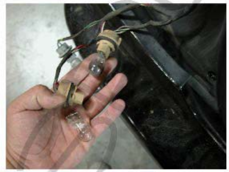
BRETOVE the three bulbs from the sockets