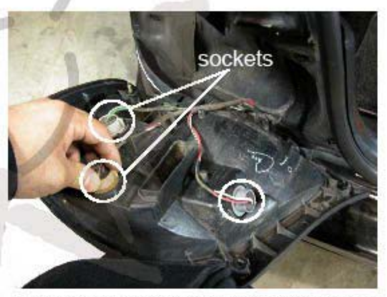
Remove all the sockets by turning them counter clockwise to unlock them