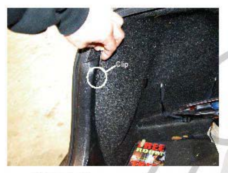
1. Remove the dip

Do not make direct contact with the halogen bulb or the wire assembly until the unit has cooled down after use.