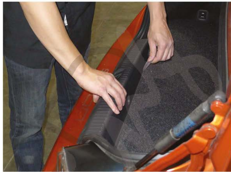
24. Replace the plastic trunk moulding