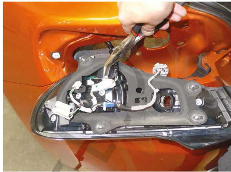
12. Remove the tail light harness from the tail light