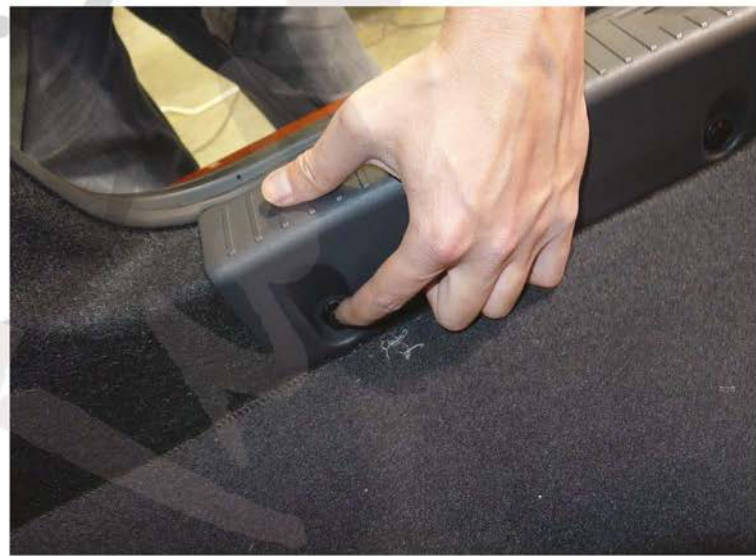
26. Replace the (3) plastic clips