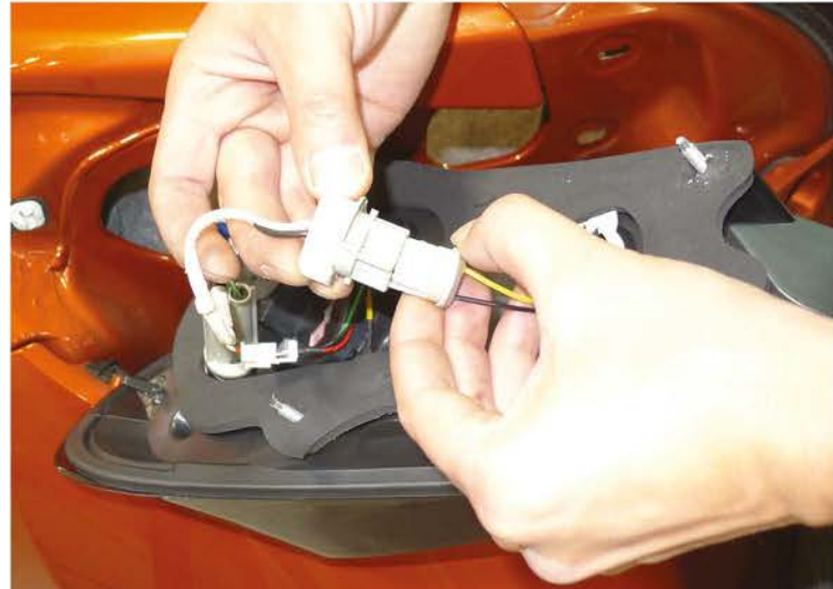
16. Connect the LED tail light harness to the tail light socket