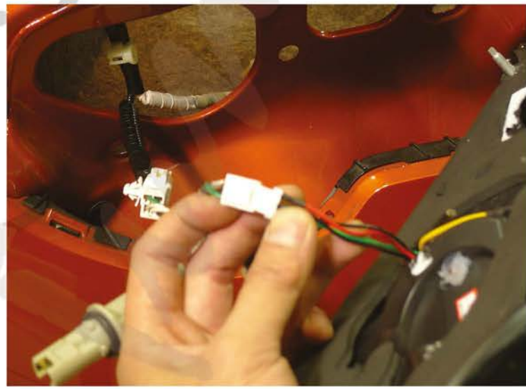
14. Connect the tail light harness to the LED taillight

please see the "L.E.D. tail lights installation instructions" If your tail lights don't have L.E.D. you can skip the installation instructions.