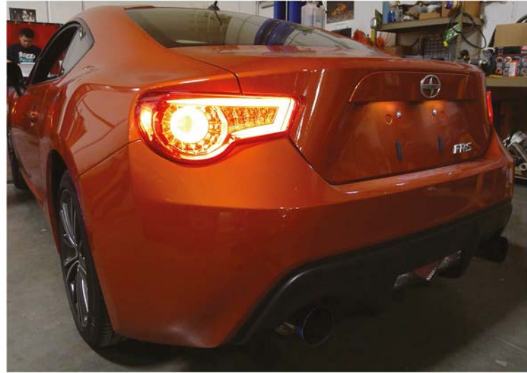
28. The installation is now complete