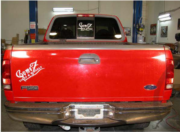
1. Open the tailgate first

If you experience any difficulties that the instruction did not cover, Please seek local auto shop for advise. Please wear protection before you work on your vehicle. An assistant is helpful when removing the front bumper. Please be careful while working with the bumper or body part to avoid scratching. Do not make direct contact with the halogen bulb or the wire assembly until the unit has cooled down after use.