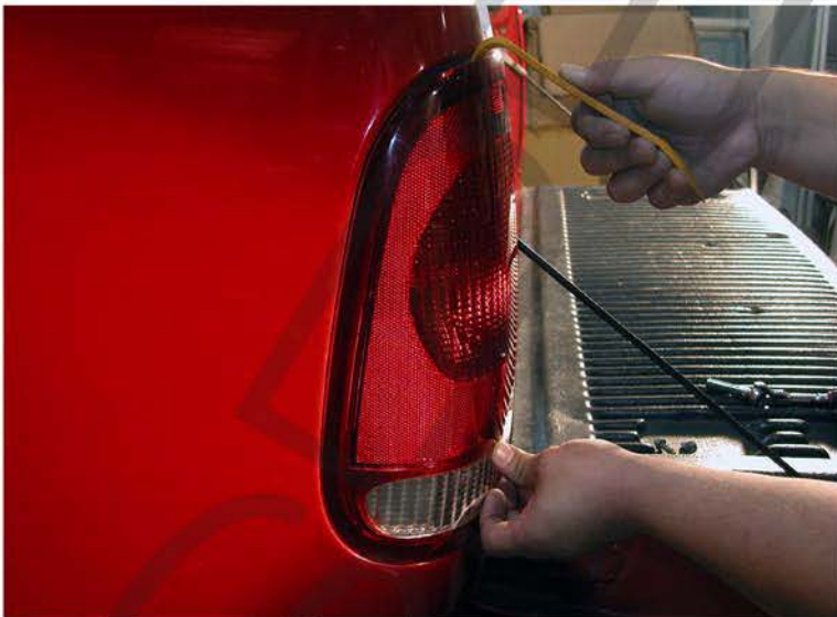
3. Use handy remover to pull out the tail light