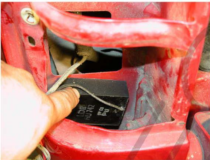
7. Stick the relay inside the tail light spot, and connect all the connectors with the new tail light

please see the "L.E.D. TAIL LIGHTS installation instructions" If your Tail lights don't have L.E.D. You can skip the installation instructions.