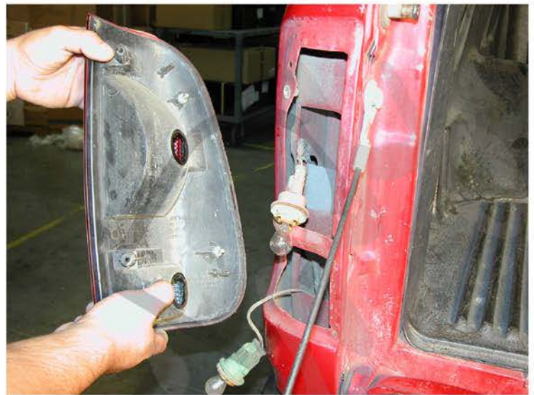
6. After disconnecting all the connectors, remove the OEM tail light