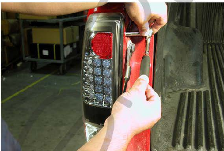
9. Install the two bolts to stabilize the tail light (Please do the other side follow the picture order from 1 to 9 )