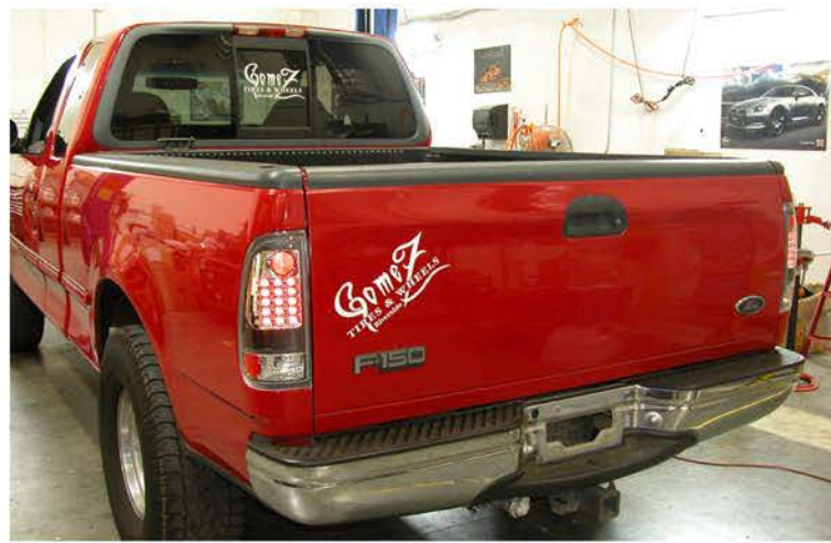
10. The installation is now complete