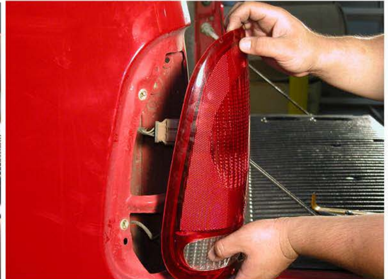
4. Pull out the tail light slightly, just enough to see the back of the tail light