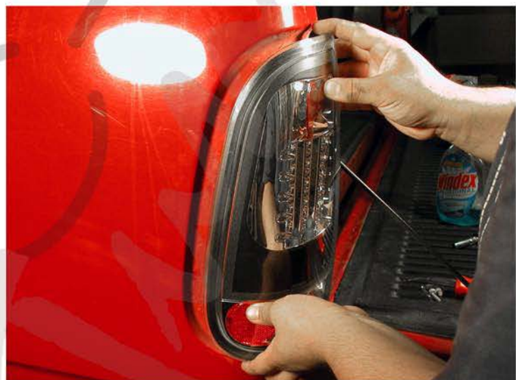
8. Install the new tail light back to its original spot

please see the "L.E.D. TAIL LIGHTS installation instructions" If your Tail lights don't have L.E.D. You can skip the installation instructions.