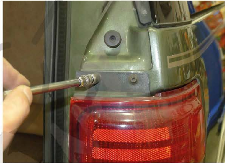
2. Remove the (2) 7mm bolts