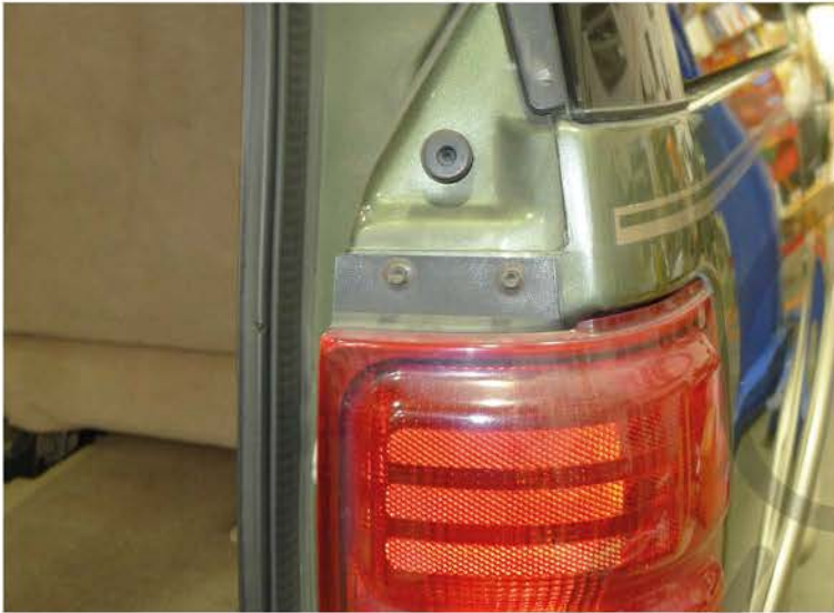
1. (2) 7mm bolts location

Do not make direct contact with the halogen bulbs or the wire assembly until the unit has cooled down after use.