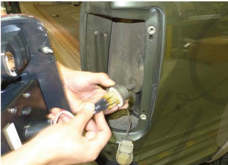
7. Connect the LED taillight harness to the taillight socket

Please see the "L.E.D. tail lights installation instructions" If your tail lights don't have L.E.D. you can skip the installation instructions.