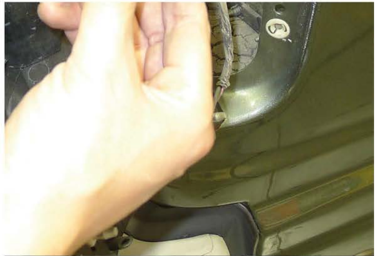
4. Remove the taillight sockets