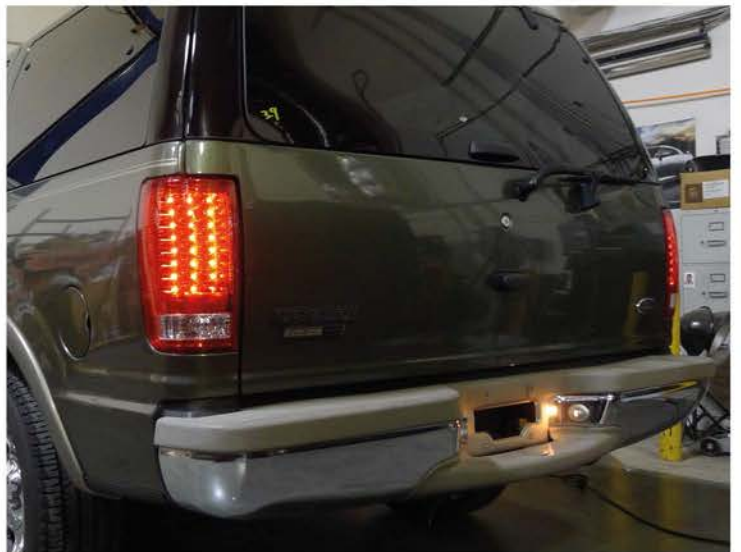
10. The installation is now complete.