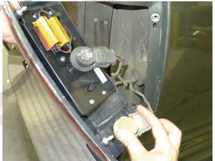
8. Install the taillight socket into the LED taillight Install the reverse light socket into the LED taillight

Please see the "L.E.D. tail lights installation instructions" If your tail lights don't have L.E.D. you can skip the installation instructions.