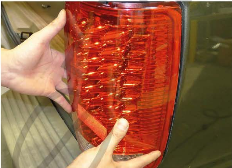
9. Place the LED taillight in the stock location Please repeat the steps in order from 1 to 9 for the opposite side.