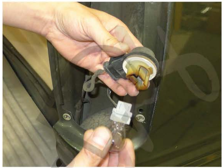
6. Remove the taillight bulb