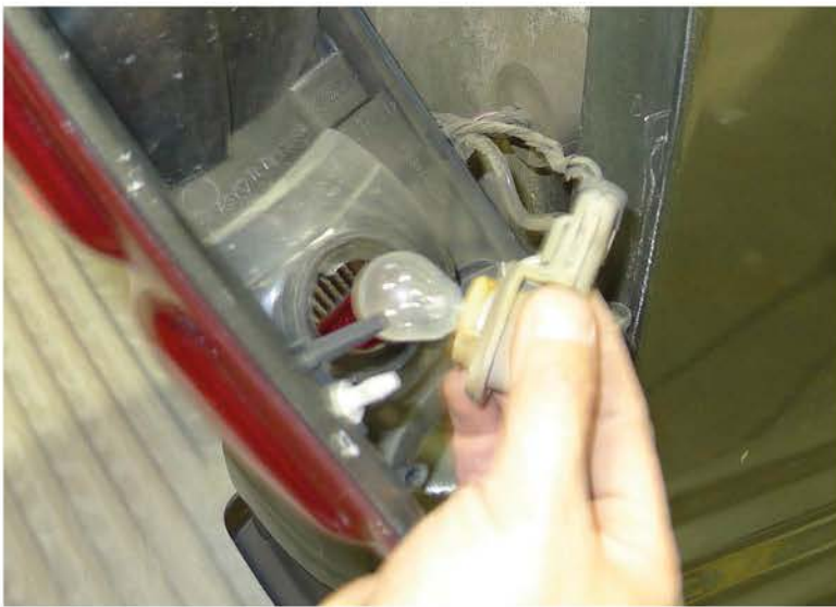
5. Remove the taillight sockets