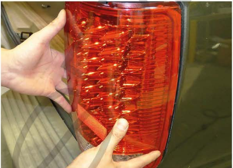
9. Place the LED taillight in the stock location Please repeat the steps in order from 1 to 9 for the opposite side.