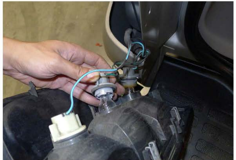
4. Remove the brake light bulbs