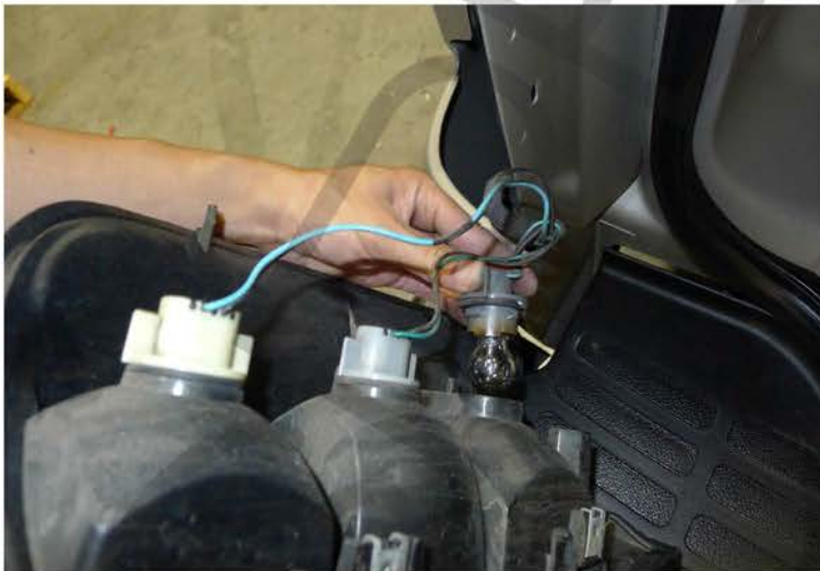
3. Remove the tail light sockets from the tail light