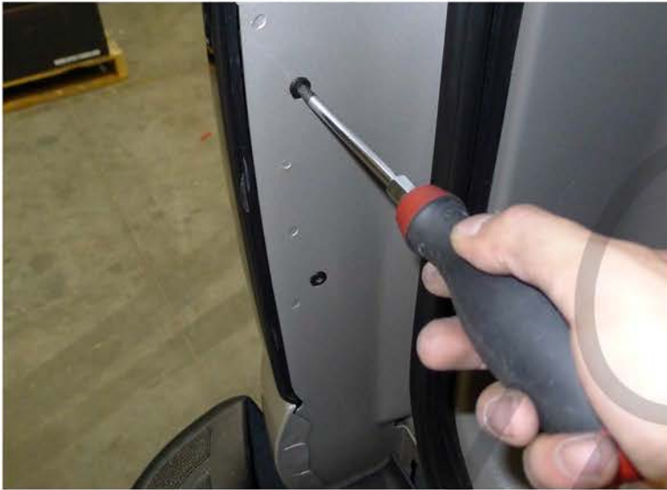
1. Remove the (2) phillips head screws

Do not make direct contact with the halogen bulbs or the wire assembly until the unit has cooled down after use.