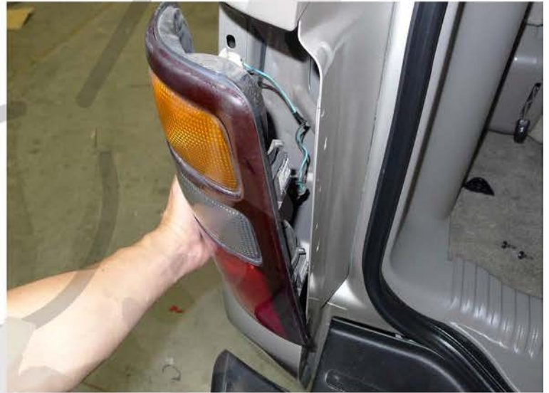
2. Remove the tail light